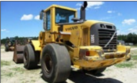
2006 Volvo L120E