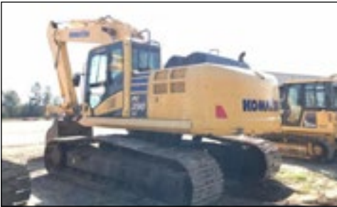
2013 Komatsu PC290LC-10