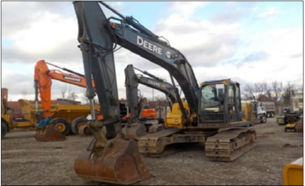
2012 John Deere 200D LC