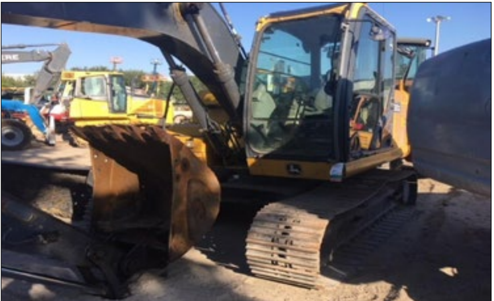
2013 John Deere 130G