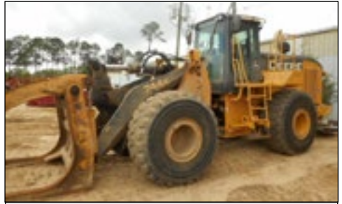
2012 John Deere 744K