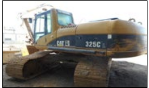
2003 Caterpillar 325CL