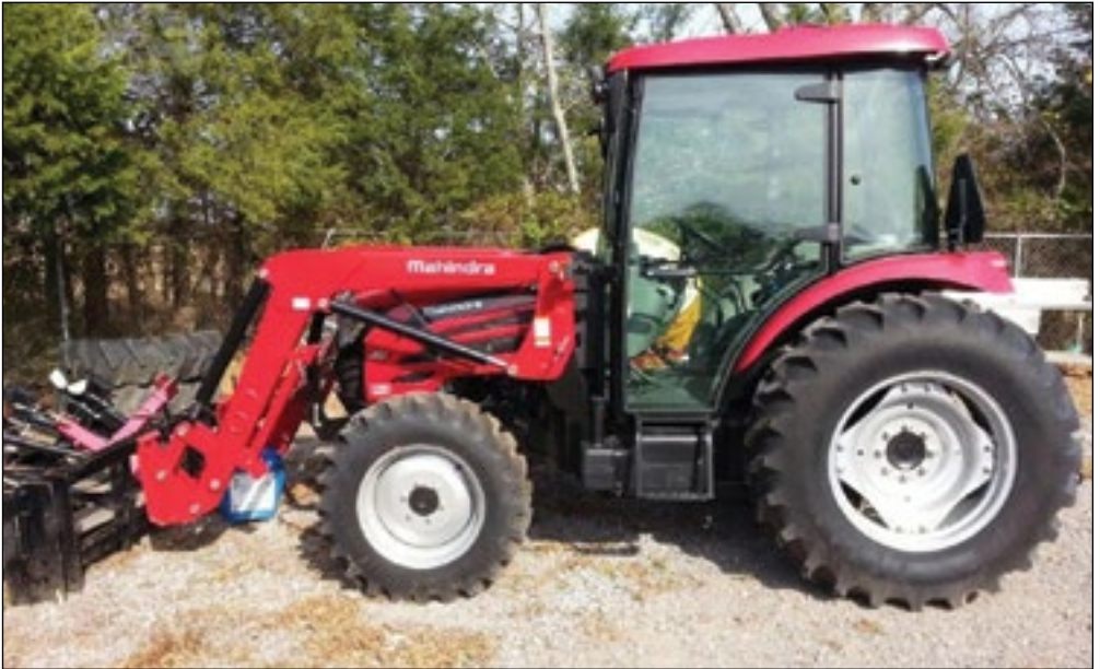
2017 Mahindra 2565