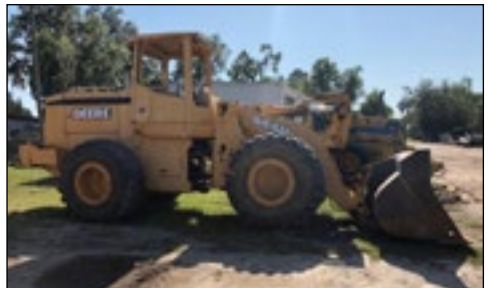
2000 John Deere 644H