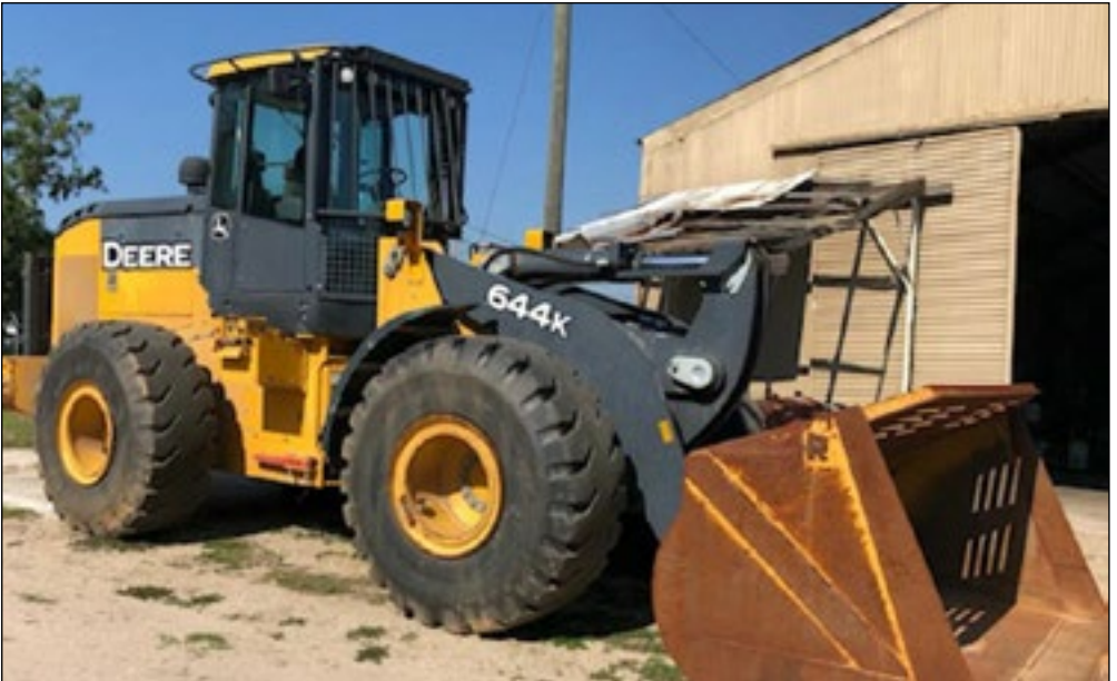
2015 John Deere 644K - choice