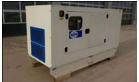
Unused FG Wilson P110-3 - choice