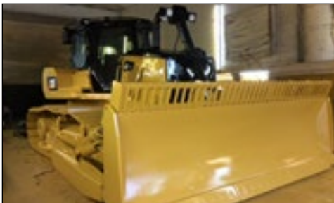
2011 Caterpillar D7E LGP