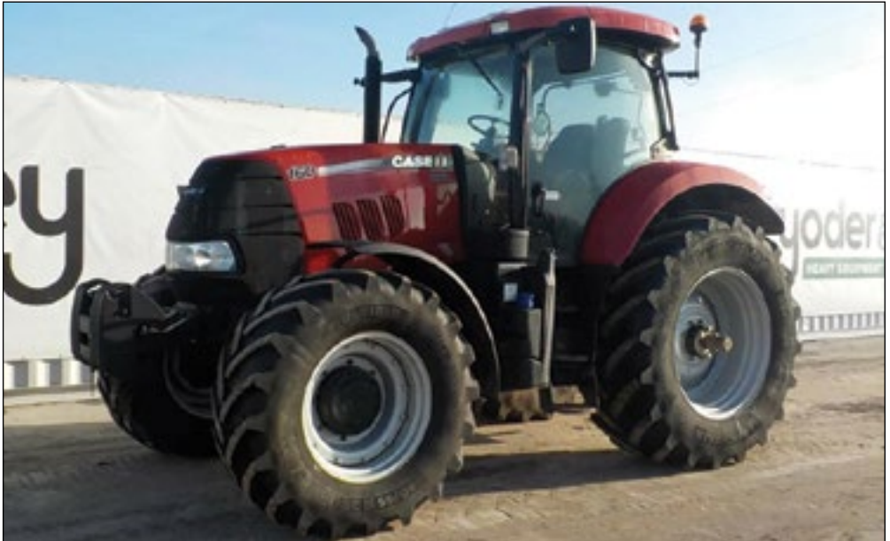
2015 Case Puma 160