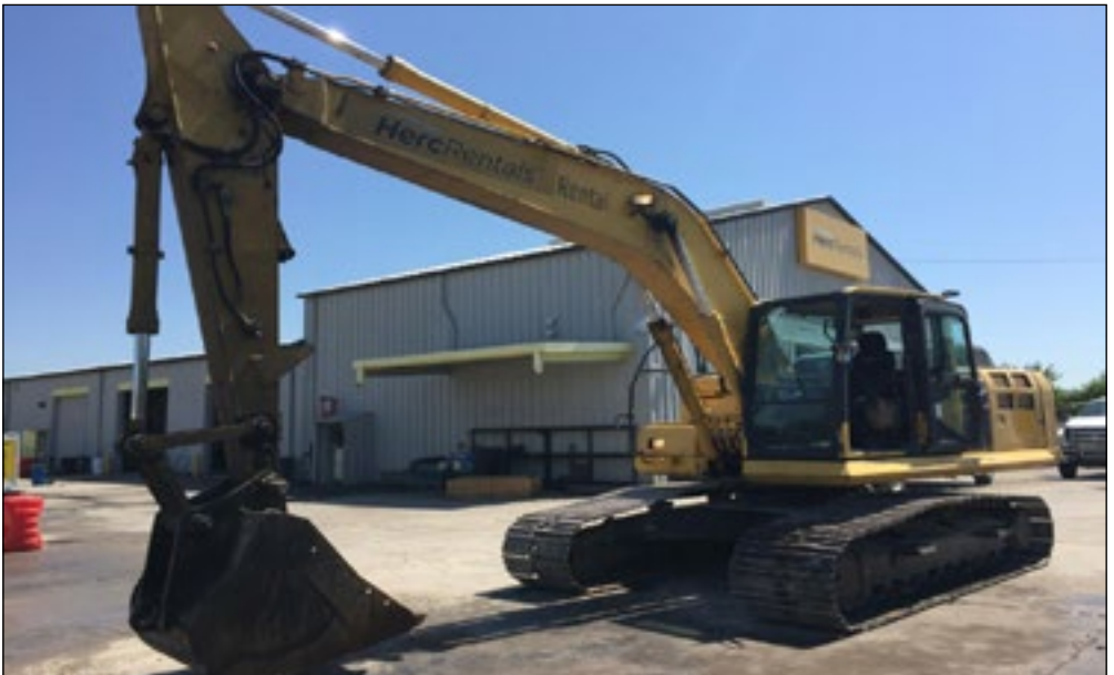
2012 Komatsu PC210LC-10