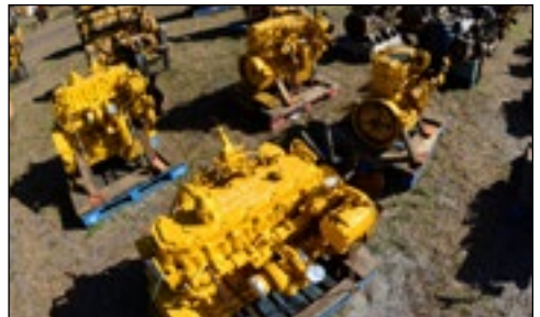
Large Selection of Engines