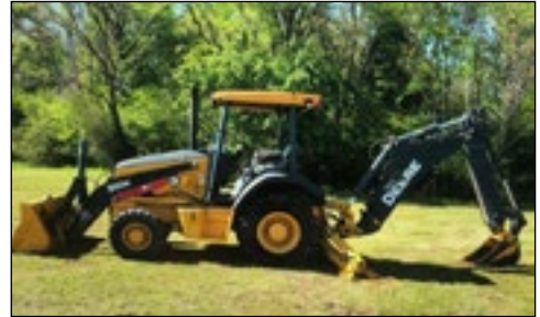
2012 John Deere 310K (1800 hours)