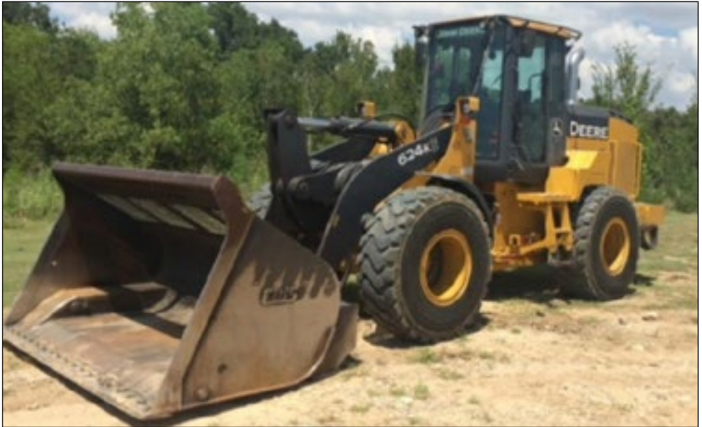
2014 John Deere 624K