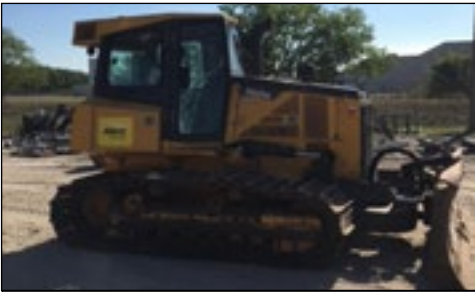
2013 John Deere 700K