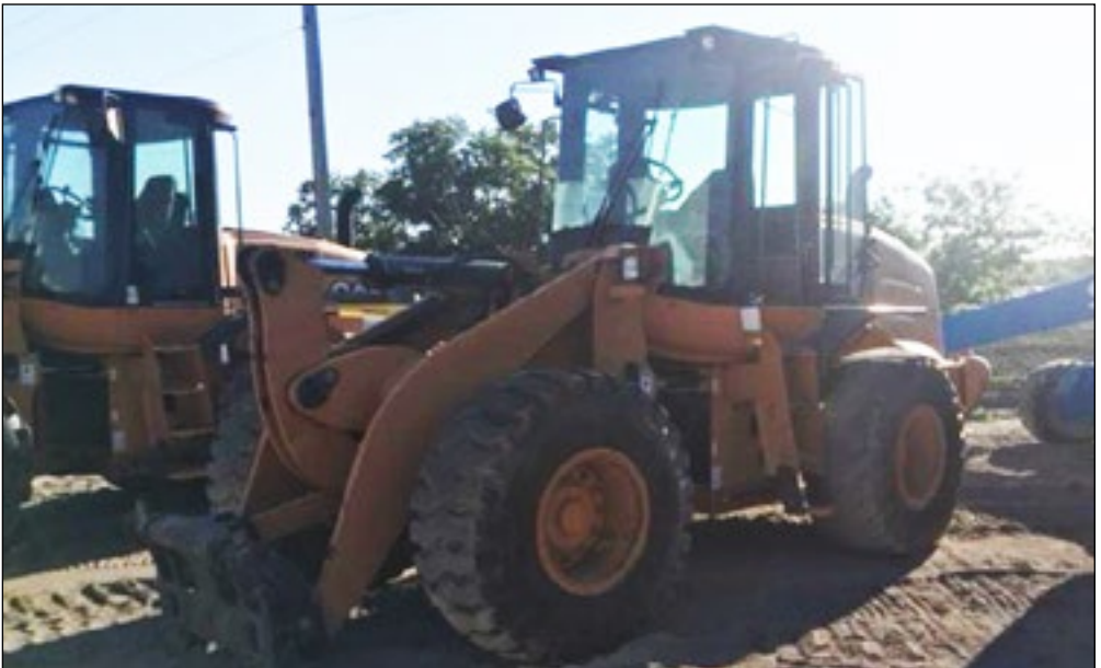
2013 Case 621F