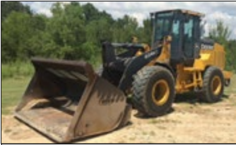
2014 John Deere 624K - choice