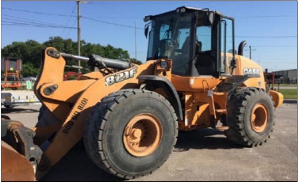
2012 Case 821F