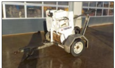
Terex Benford MBR 71B Single Drum Vibrating Pedestrian Roller