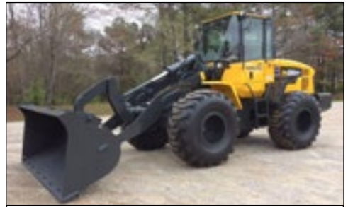
2005 Komatsu WA200PT-5