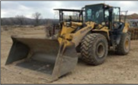
2013 Komatsu WA470-7