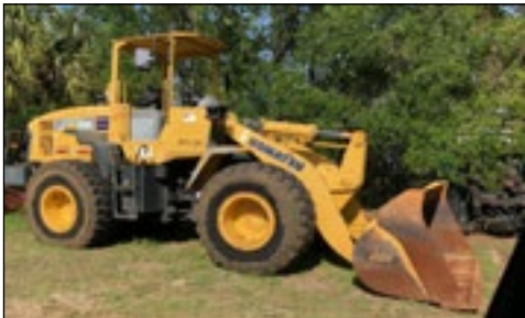
2006 Komatsu WA200