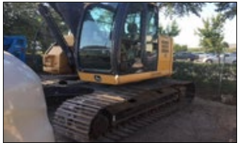
2012 John Deere 225D LC