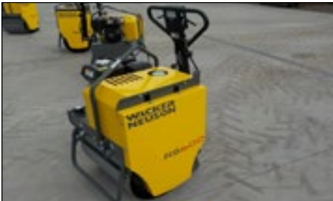
Unused Wacker Neuson RS600 - choice