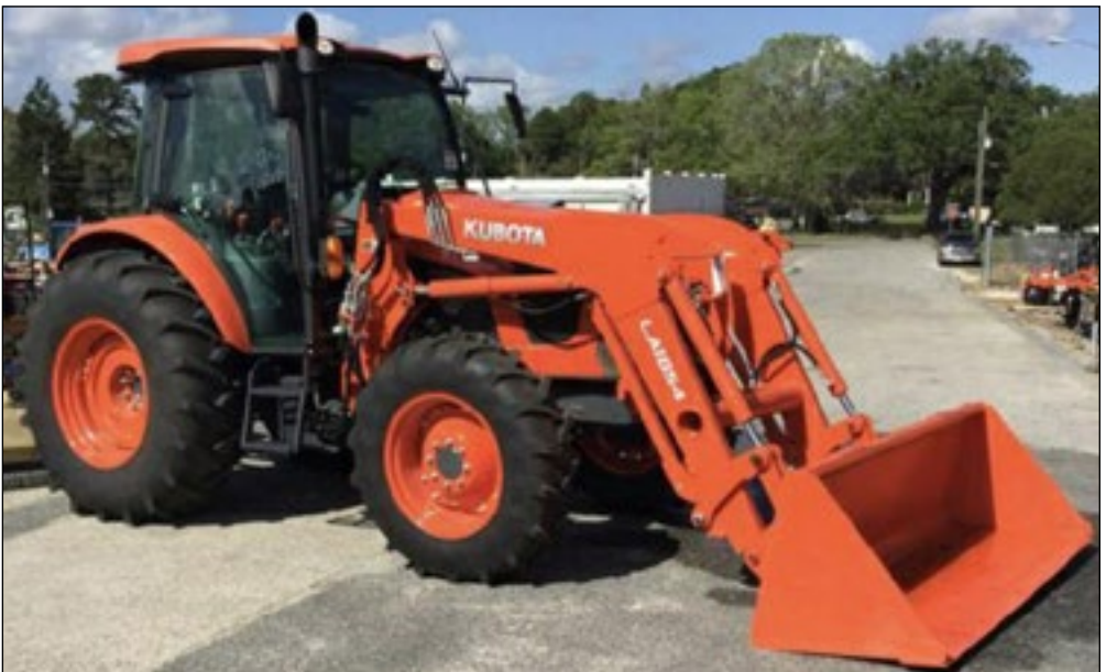
Unused Kubota M5-091