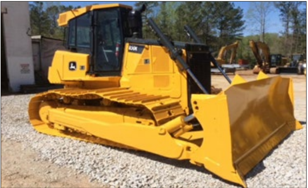
2012 John Deere 850K