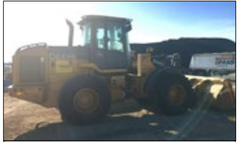
2012 John Deere 544K