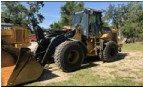
2006 John Deere 624J