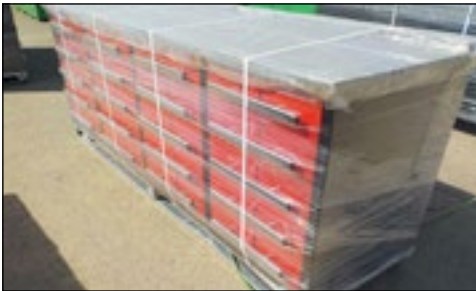
Unused 7" Work Bench/Tool Cabinet - choice