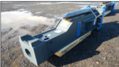
Unused Hammer HM1900 Sold to a buyer from QLD