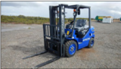
Unused Apache HH30Z Sold to a buyer from NSW