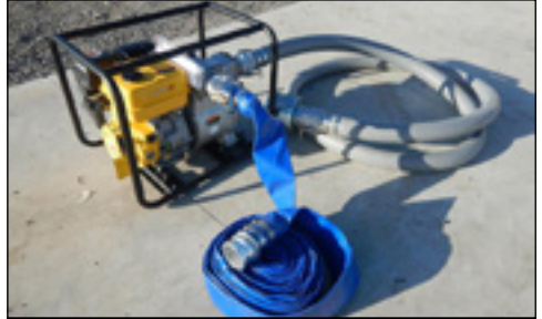
Large Selection of Unused 4" to 2" Water Pumps