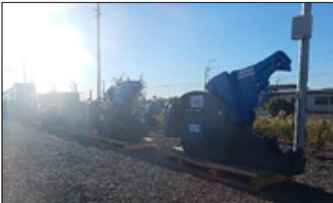
Large Selection of Unused Excavator Attachments