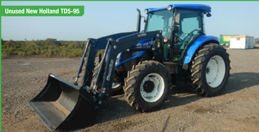
Unused New Holland TD5-95