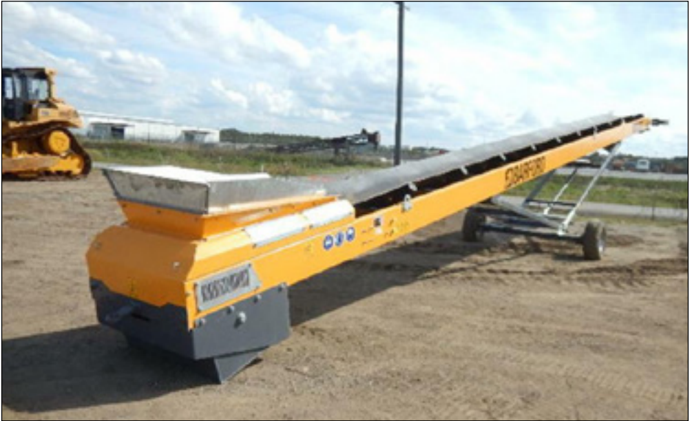
Unused Barford W5032 Wheeled Stockpile Conveyor 50ft x 32"