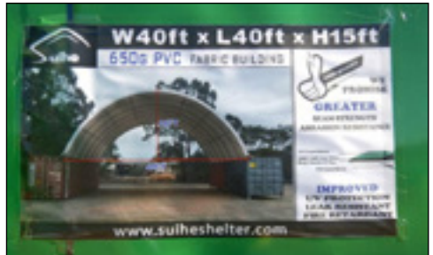
Large Selection of Container Shelters