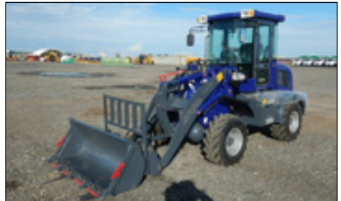
Unused Apache AP218