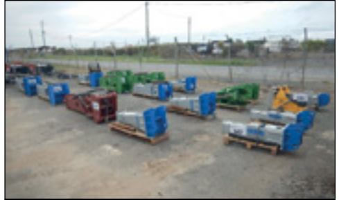
Large Selection of Unused Hammers