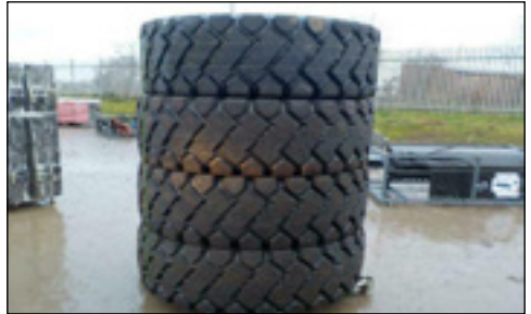
Unused 23.5-25 Tyres, 24PR E-3/L-3 TL (4 of) - choice