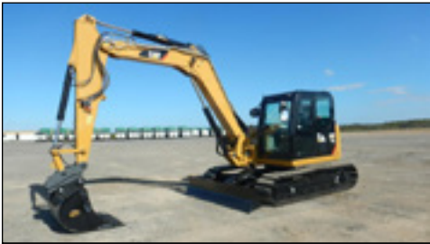
Unused CAT 308E2CR Sold to a buyer from NSW