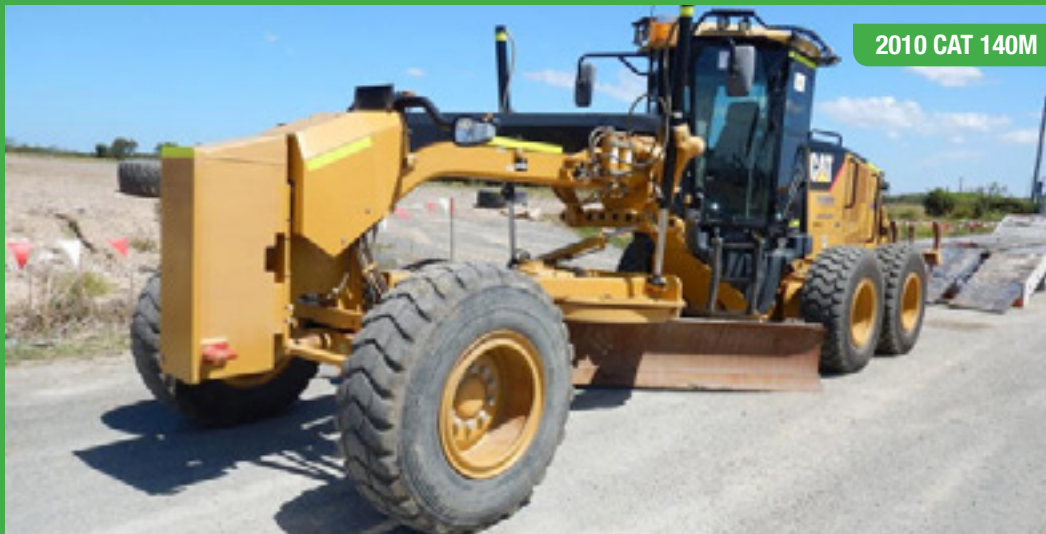
2010 CAT 140M