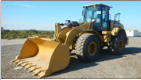
Unused CAT 950GC Sold to a buyer from WA