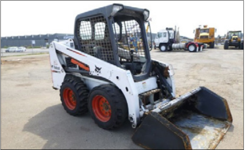
2015 Bobcat S450