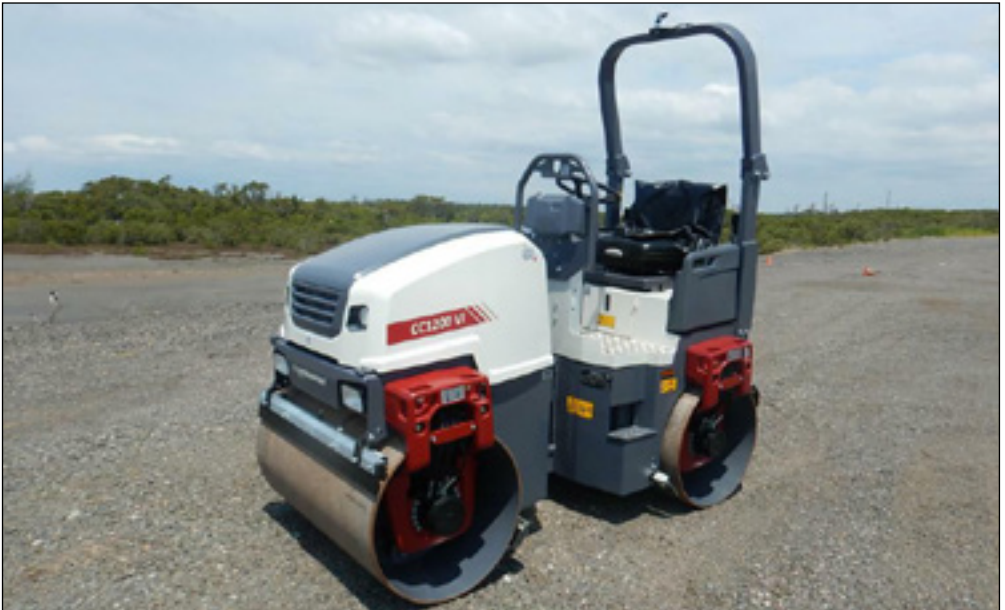
Unused Dynapac CC1200