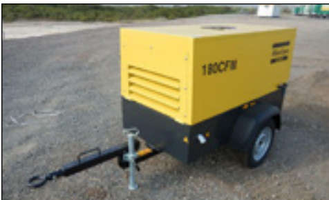
Unused Atlas Copco Liutech 180CFM