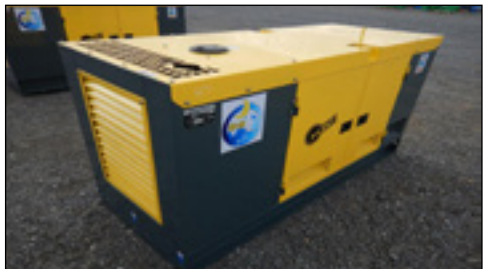
Unused Ashita AG3-50SBG 40Kva Sold to a buyer from QLD