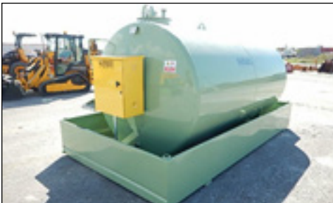
Large Selection of Unused Fuel Tanks