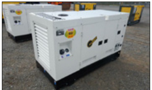
Unused 2018 Ashita AG-40 Skid Mounted 30kVA Diesel Generator