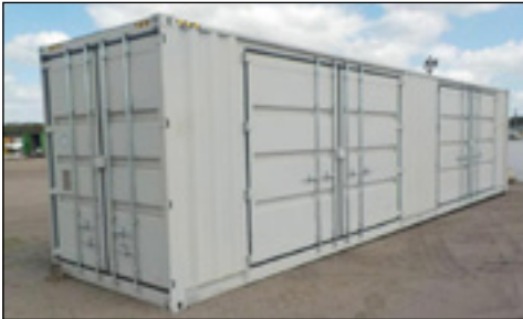
Unused 40' HC Container - choice