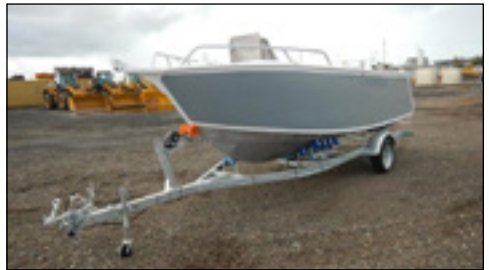
Unused Scariff Boat Sold to a buyer from QLD