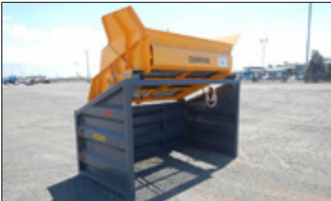
Unused Barford US70 Screener