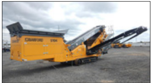
Unused Barford S104 Sold to a buyer from NSW