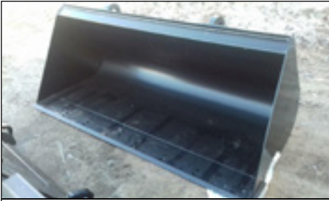
Unused JCB 88" Loading Bucket to suit Telehandler