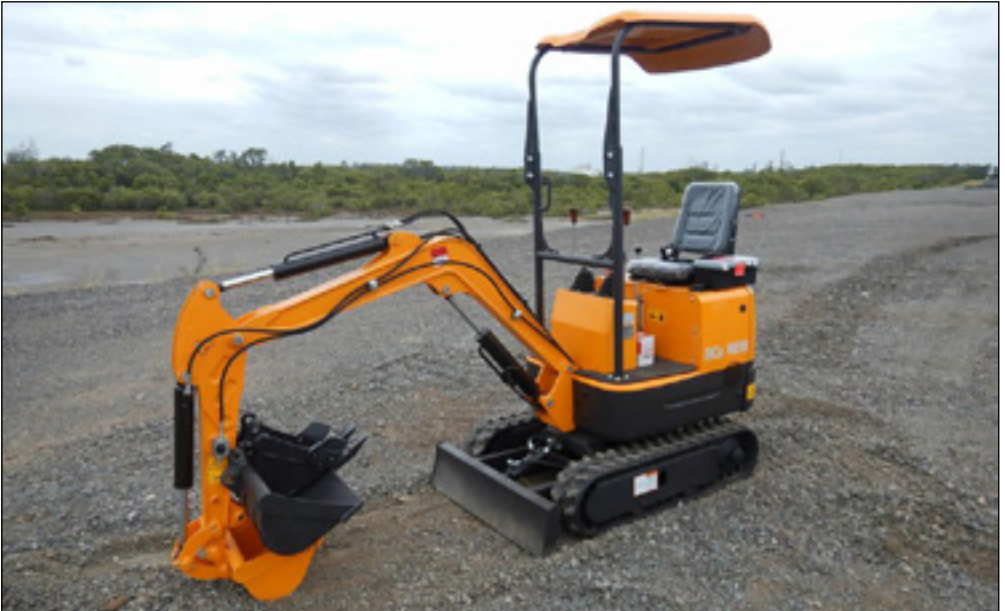
Unused Sico WE08 - choice