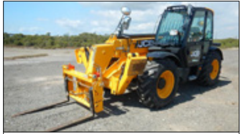
Unused JCB 533-105 Sold to a buyer from QLD