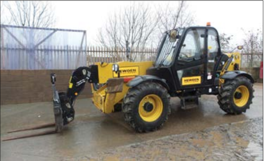
14-15 CAT TH414C - choice of 12