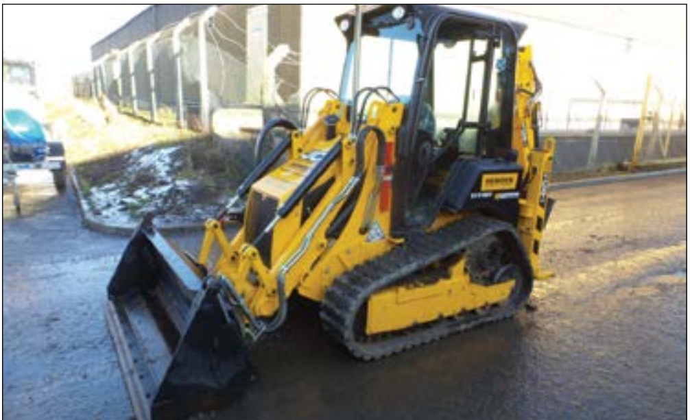
2016 JCB 1CX Tracked