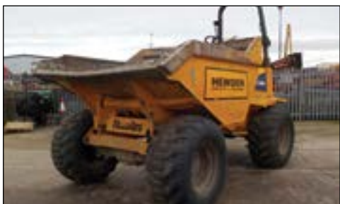
11-14 Thwaites 9 Ton - choice of 5