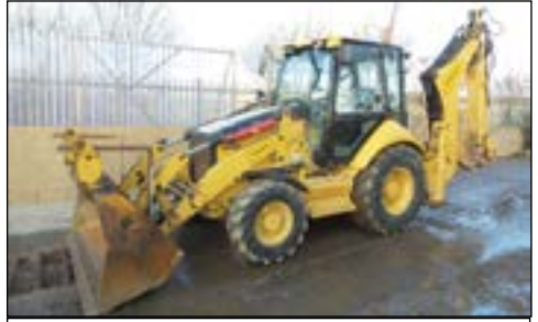
2008 CAT 432E