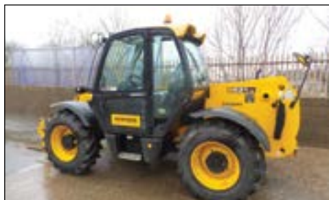
11-16 JCB 531-70 - choice of 5