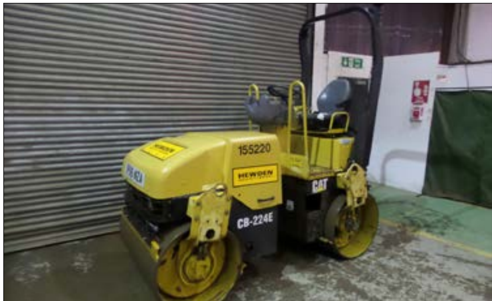
2006 CAT CB224E