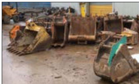
Large Selection of Buckets