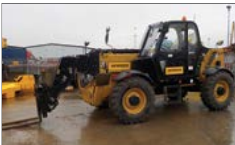
2014 CAT TH417C - choice of 6