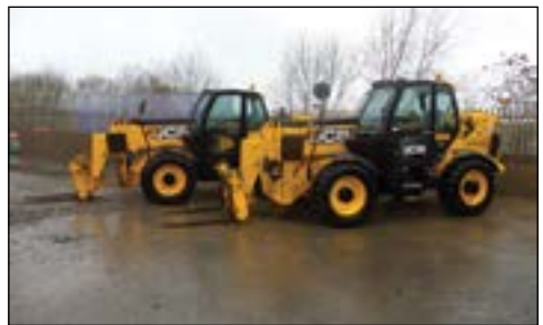
11-13 JCB 540-170 - choice of 2