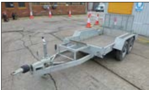
2016 Indespension AD2000 - choice of 2