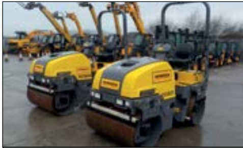
2014 Dynapac CC1200 - choice