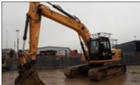
2014 JCB JS220 - choice