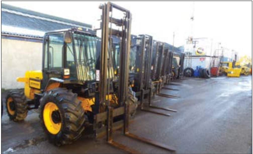
08-16 JCB 926 - choice of 9