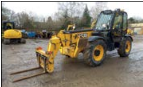
11-13 JCB 535-140 - choice of 4