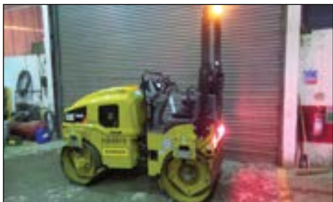
2015 CAT CB24