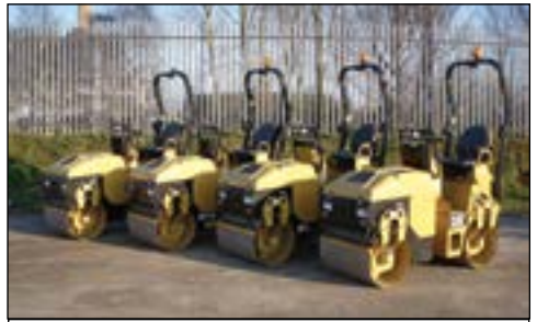
2007 CAT CB114E - choice