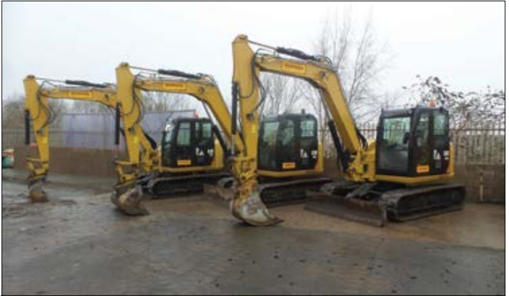
13-15 CAT 308E - choice