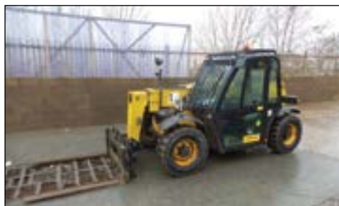
2007 CAT TH255