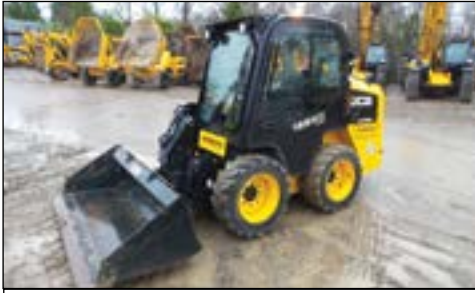
2016 JCB 155ECO - choice of 2