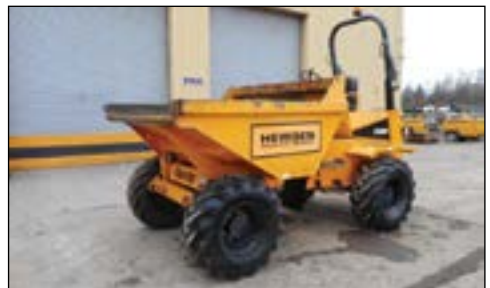
11-14 Thwaites 6 Ton Swivel - choice of 6