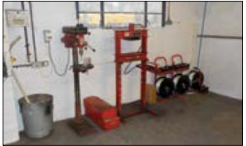
Selection of Garage Equipment