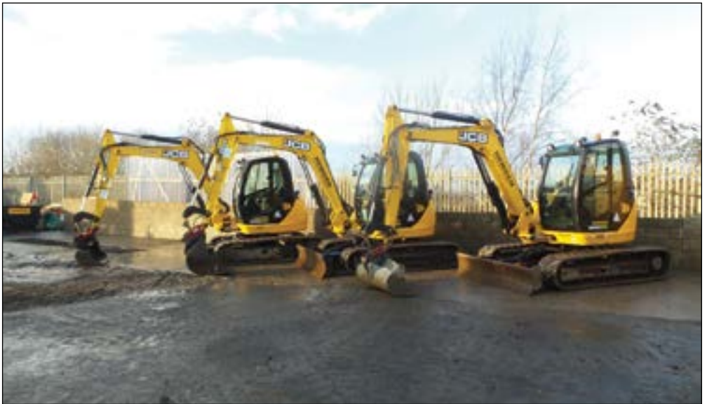
2011 JCB 8085 - choice