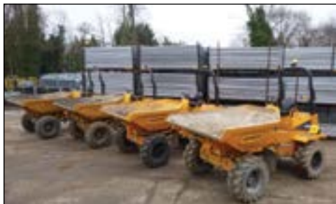
08-11 Thwaites 6 Ton Swivel - choice of 6