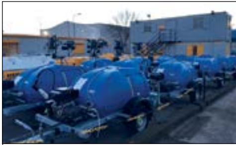
Selection of Boswers