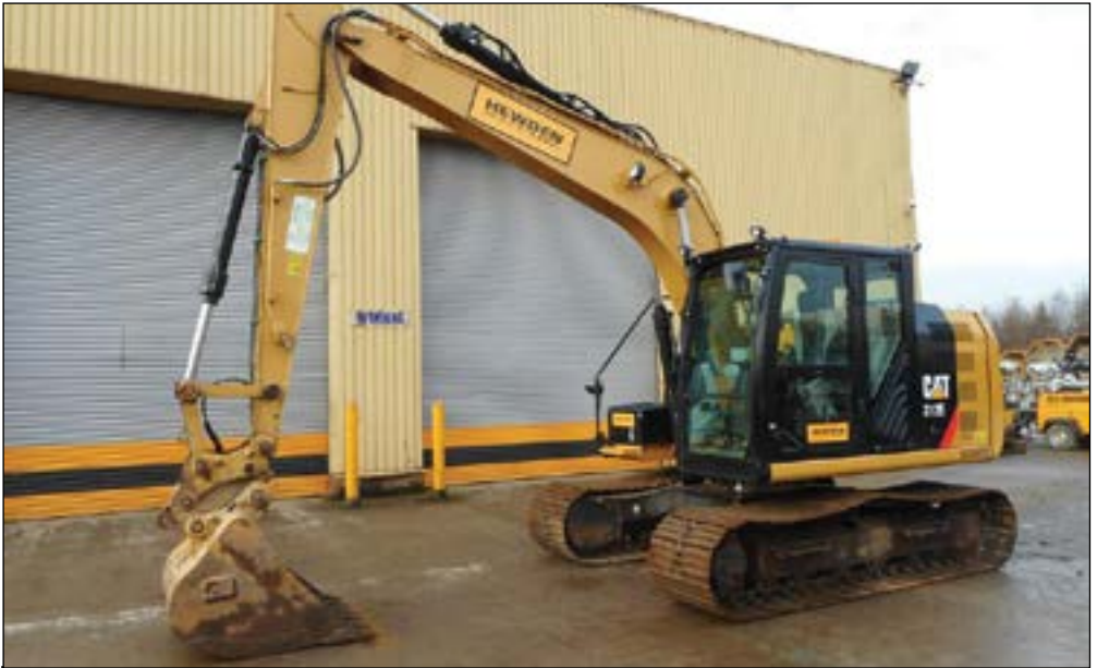
14-15 CAT 312E - choice of 3