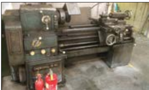
Large Selection Garage Equipment & Tools