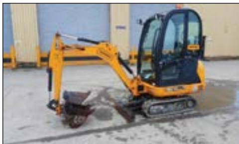
11-16 JCB 801.4 - choice of 6