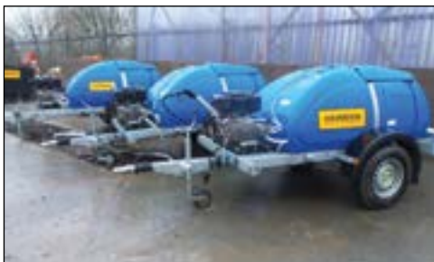
2016 Bowser Mount Pressure Wash - choice