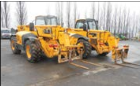
11-12 JCB 535-140 - choice of 4