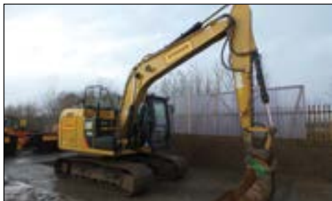
2014 CAT 312E - choice of 3