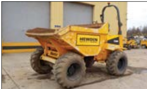
08-11 Thwaites 9 Ton - choice of 6