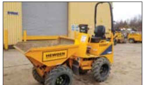
2016 Thwaites 1 Ton Hi-Tip - choice of 5