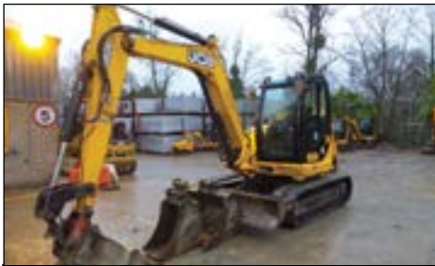
2011 JCB 8085 - choice of 3