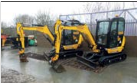
14-16 JCB 8026 - choice of 2