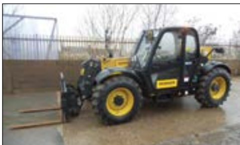
2014 CAT TH337C - choice of 2