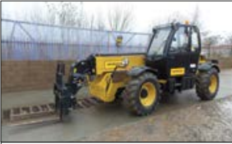
14-15 CAT TH417C - choice of 8