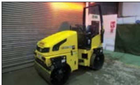
2016 JCB VMT 260-120