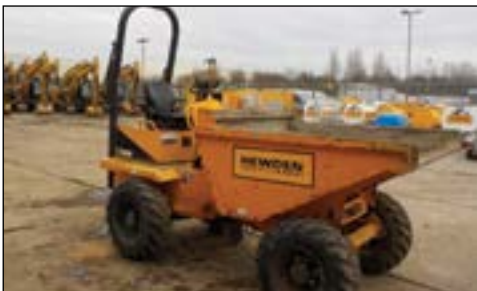
08-14 Thwaites 3 Ton Swivel - choice of 8