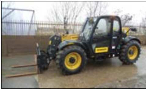
2014 CAT TH337C - choice of 2