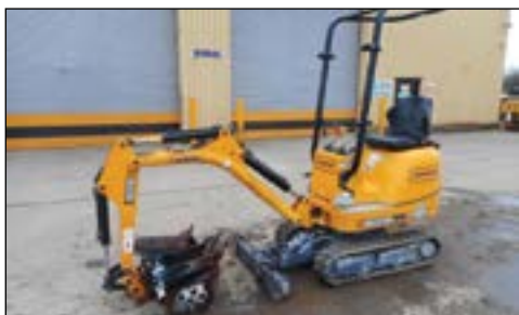
2016 JCB 8008CTS - choice of 6