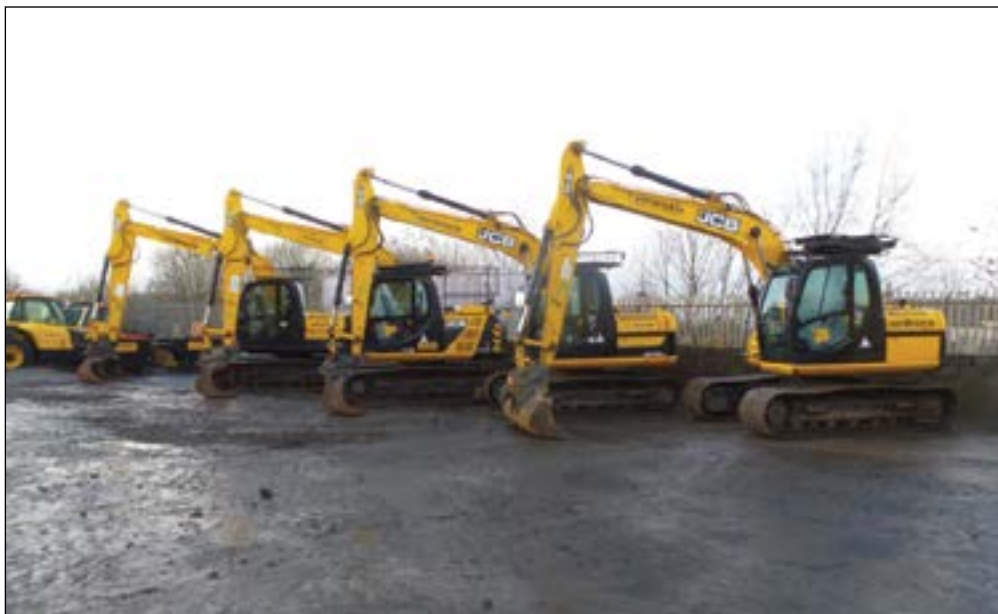
2011 JCB JS130 - choice