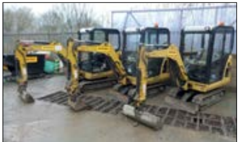
08-14 CAT 301.6 - choice of 5