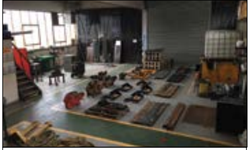
Large Selection of Garage Equipment