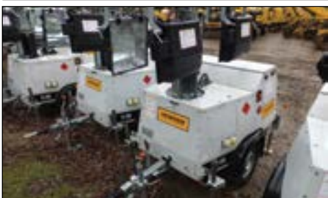
2016 LightTower - choice