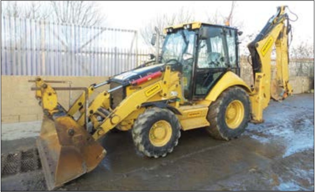
2010 CAT 432E - choice of 3