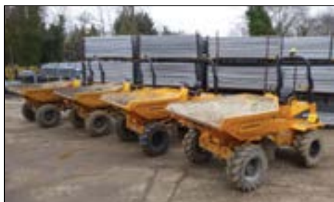
06-08 Thwaites 1 Ton Hi-Tip - choice