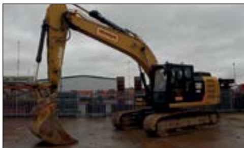
2014 CAT 320EL