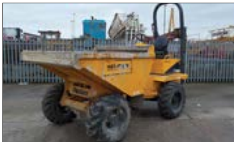
06-08 Thwaites 3 Ton - choice of 4