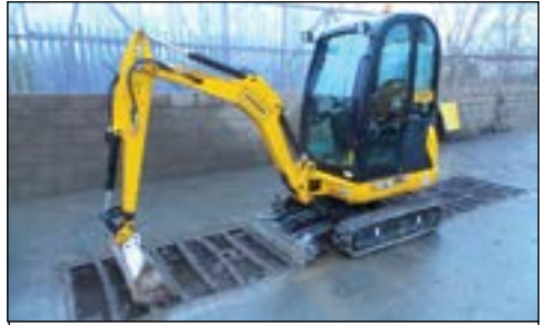
2016 JCB 801.8 - choice of 2