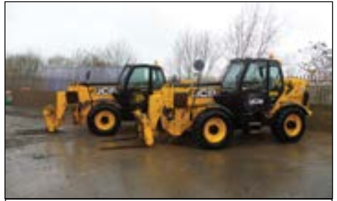
11-13 JCB 540-170 - choice of 3