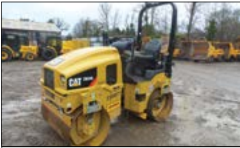
2015 CAT CB24 - choice of 2