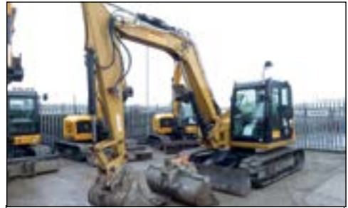
2014 CAT 308E - choice of 4