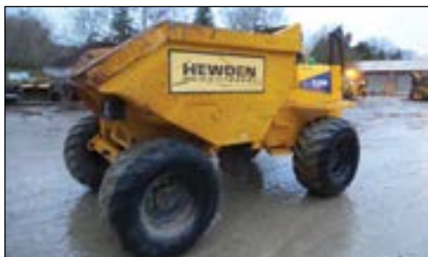
2008 Thwaites 10 Ton