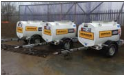
2007 Western 250G Bunded Bowser - choice