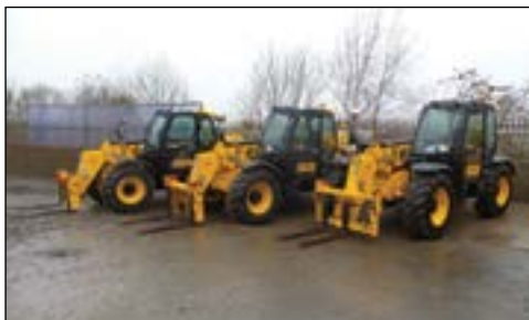
11-16 JCB 535-95 - choice of 5