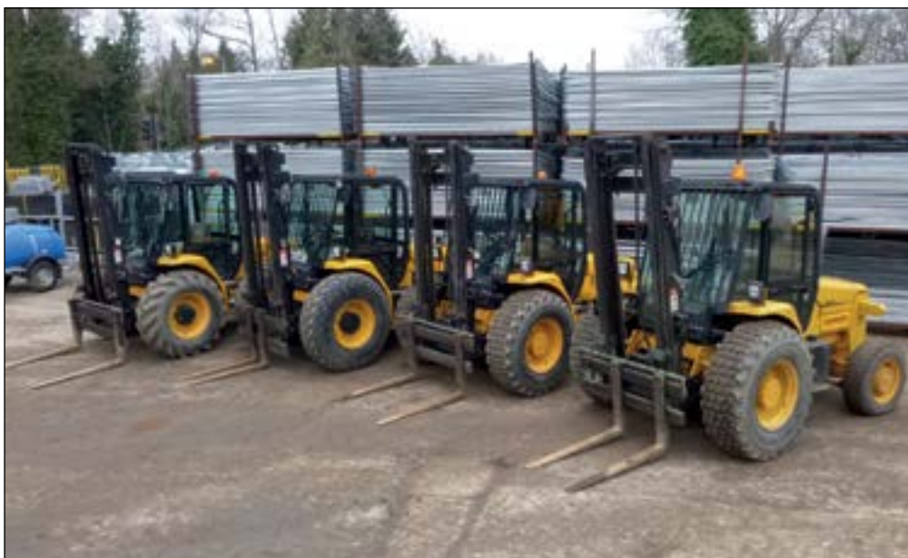
04-08 JCB 926 - choice of 9