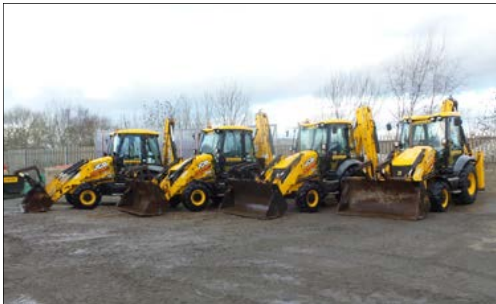
2011 JCB 3CX P21 ECO - choice