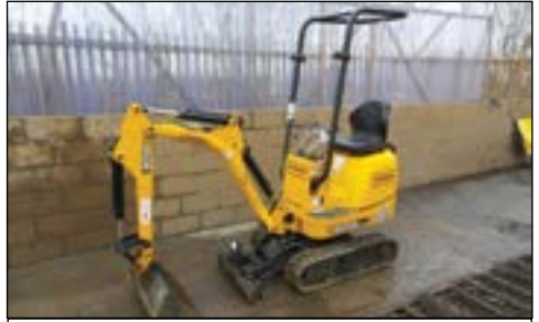
2016 JCB 8008CTS