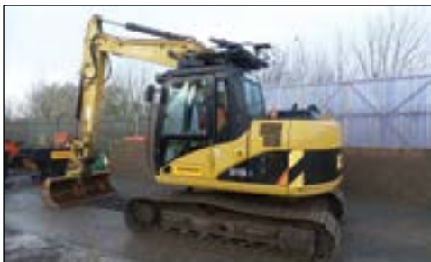
07-08 CAT 311C - choice of 2