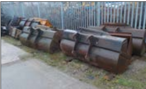
Large Selection of Buckets