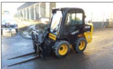
2016 JCB 155T