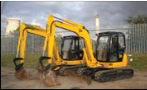
14-16 JCB 805 - choice of 2