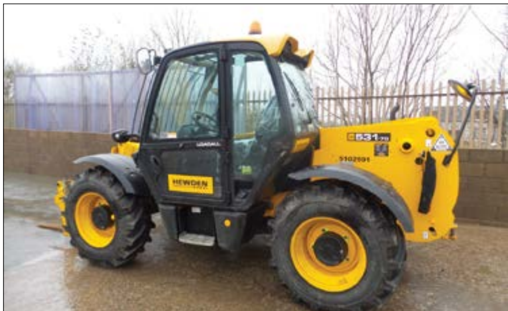
2014 JCB 531-70 - choice of 3