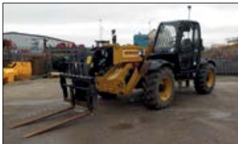
14-15 CAT TH414C - choice of 10