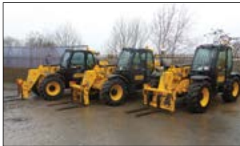
11-16 JCB 535-95 - choice of 10