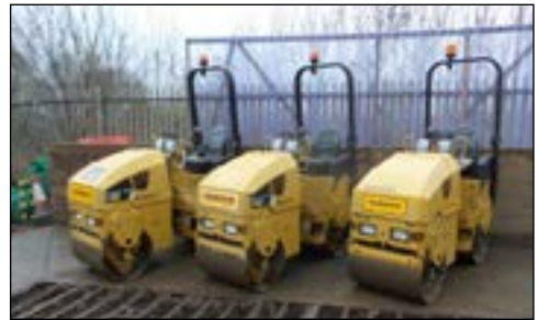
2008 CAT CB14 - choice