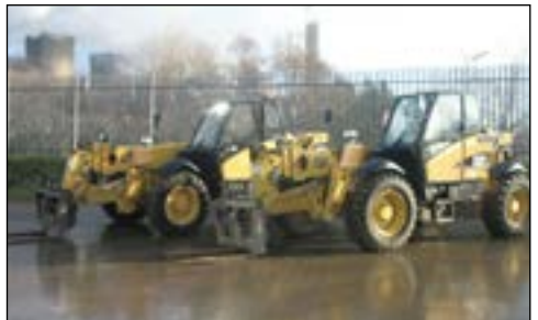
2007 CAT TH360B - choice