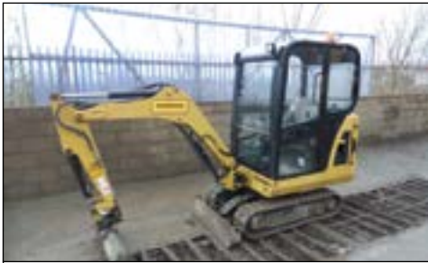
2014 CAT 301.4