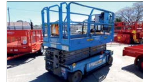
02-03 Genie GS2646 - choice of 3