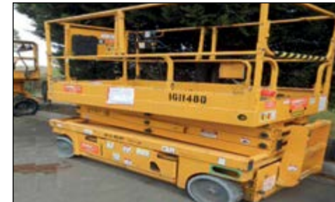
2008 Haulotte Compact 10