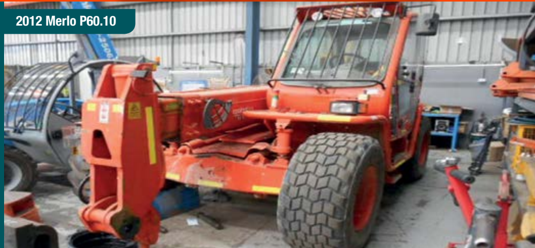
2012 Merlo P60.10