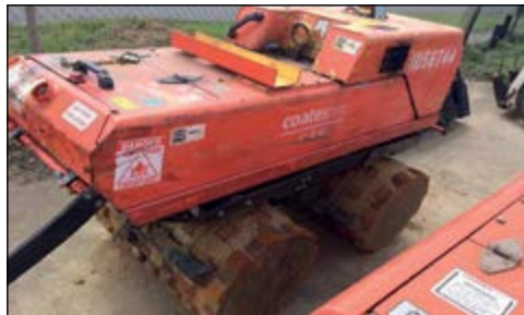
2011 Dynapac LP8504