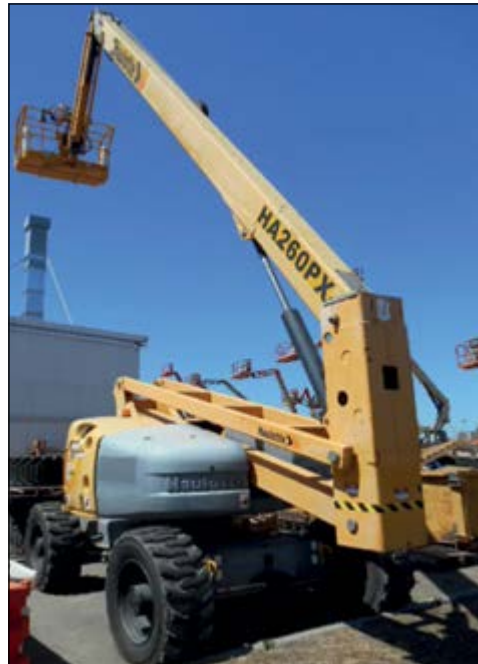
2008 Haulotte HA260PX