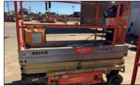
2007 JLG 1930ES Extending Deck