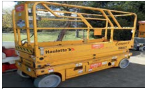
2008 Haulotte Compact 8 - choice of 3