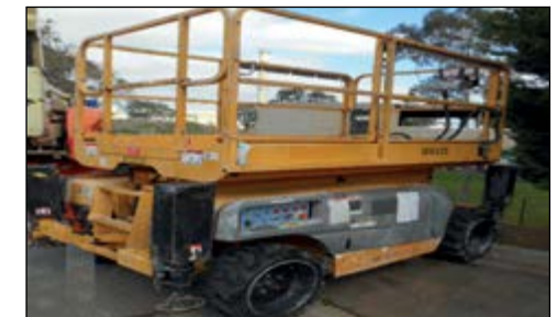
2008 Haulotte Compact 10DX