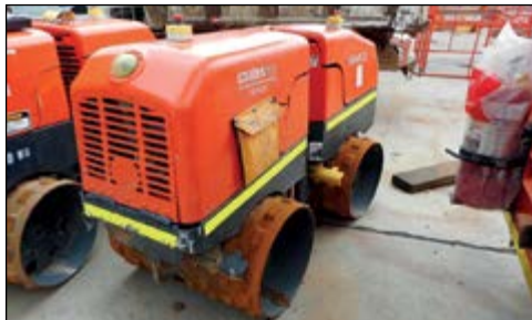
11-12 Wacker RT82-SC - choice of 2