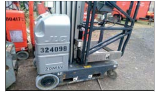
2008 JLG 20MVL