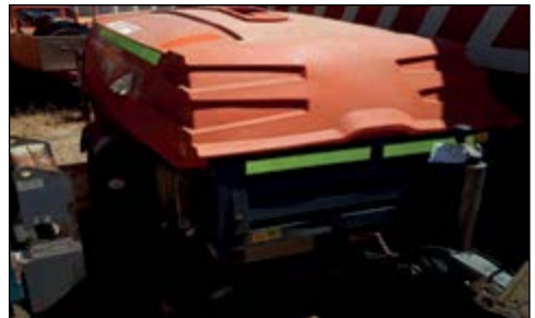
2009 Atlas Copco XAS67DD7