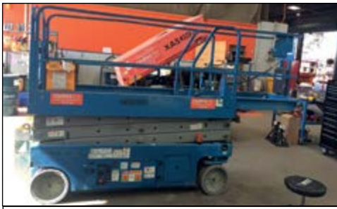
2008 Genie GS2032 Extending Deck