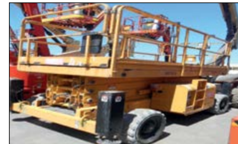
2009 Haulotte H15SX