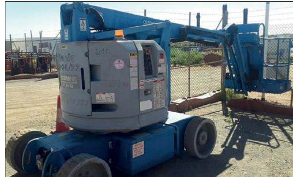
03-04 Genie Z34/22N - choice of 2