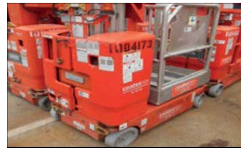
2010 Genie GR15 - choice of 3