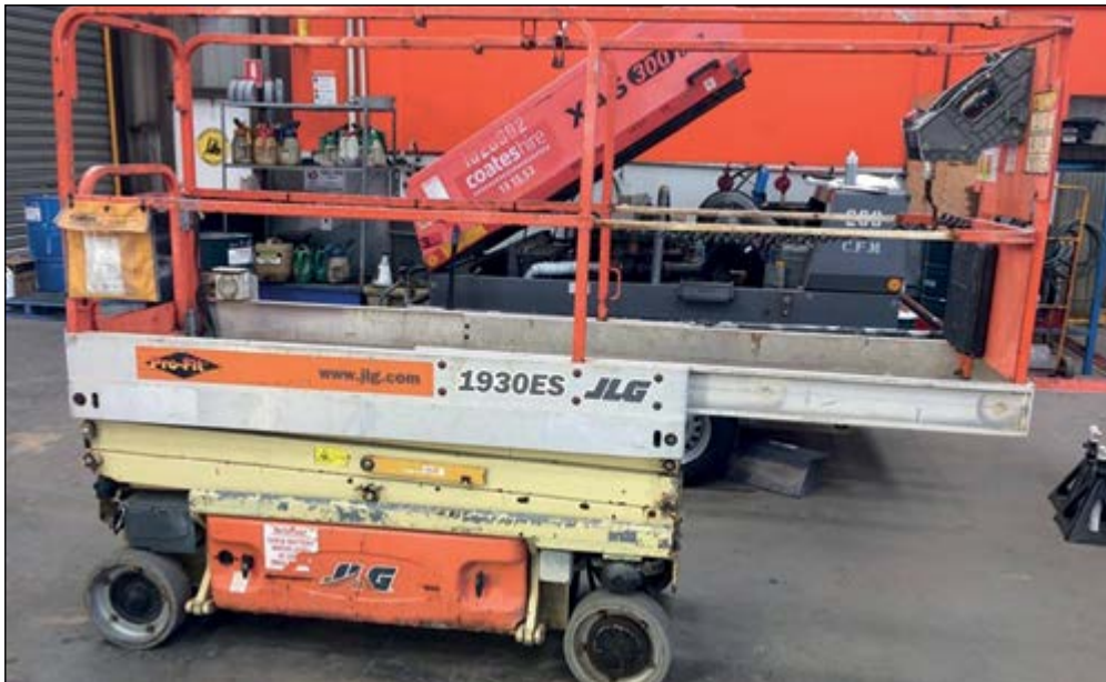
2007 JLG 1930ES Extending Deck