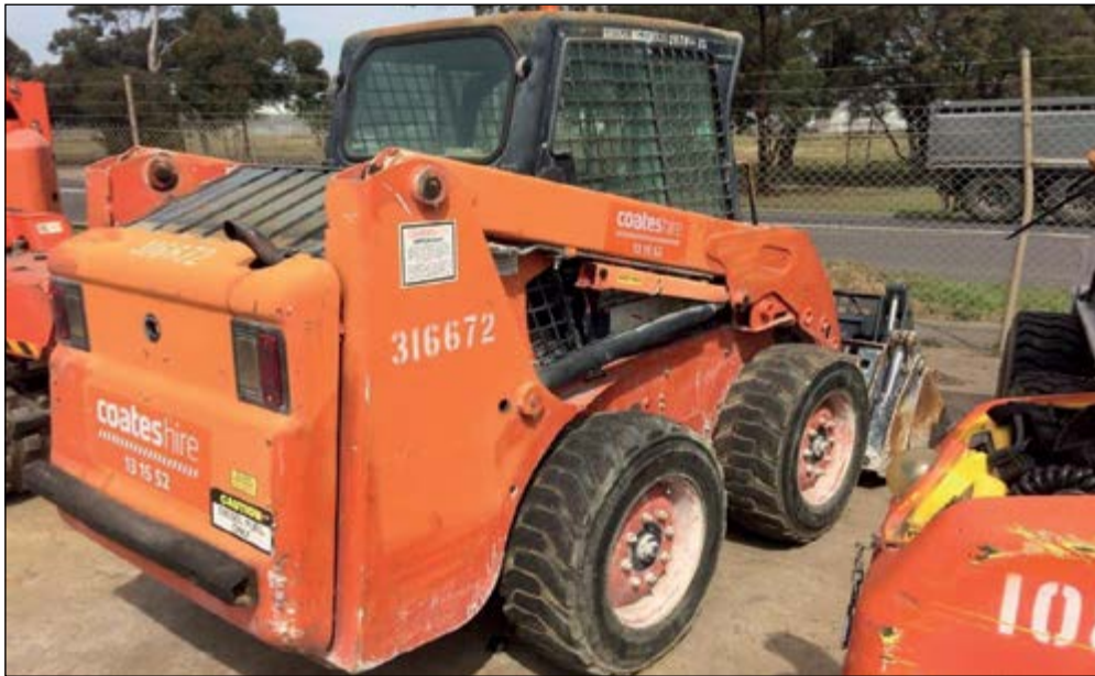
2007 Bobcat S150