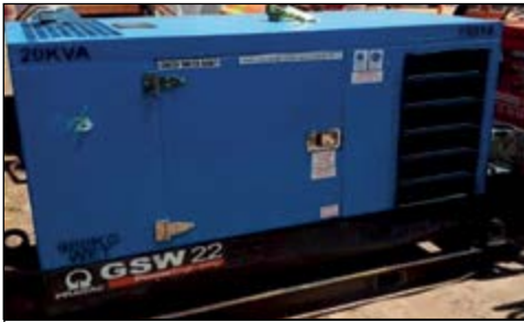
2014 Pramac GSW20