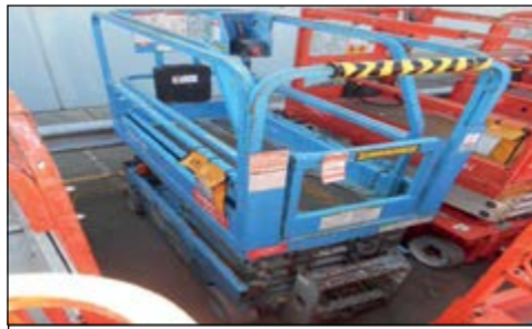
2008 Genie GS1932