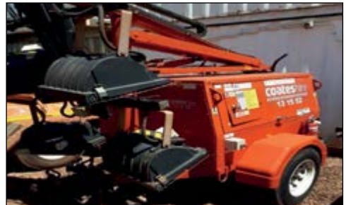
2007 JLG 6308AN Lighting Tower