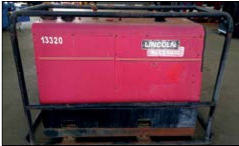
Lincoln Vantage 575A