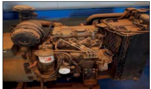
2010 Kubota D1403BG 13 Kva Engine & Generator Suitable for 3 Phase