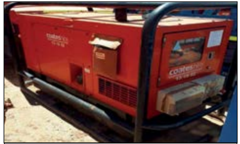
2006 Kubota SQ3200