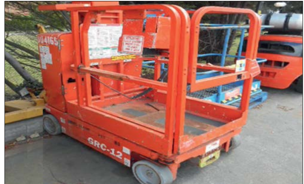
2010 Genie GRC12 Extending Deck - choice of 3