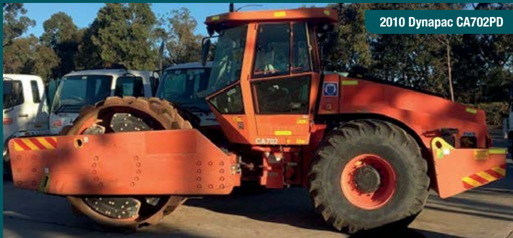
2010 Dynapac CA702PD

ONLINE TIMED AUCTION BIDDING NOW OPEN UNTIL 14TH DECEMBER 2017