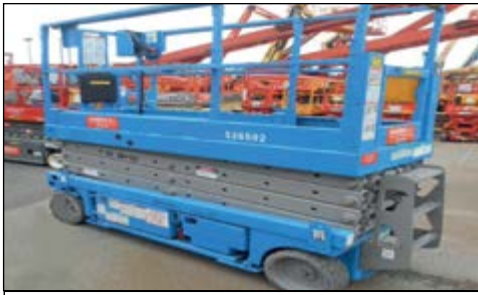
2002 Genie GS2632