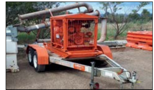
2004 Gormann Rupp T4A3-B