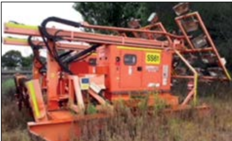
2011 Allight SS15K-12 Lighting Tower