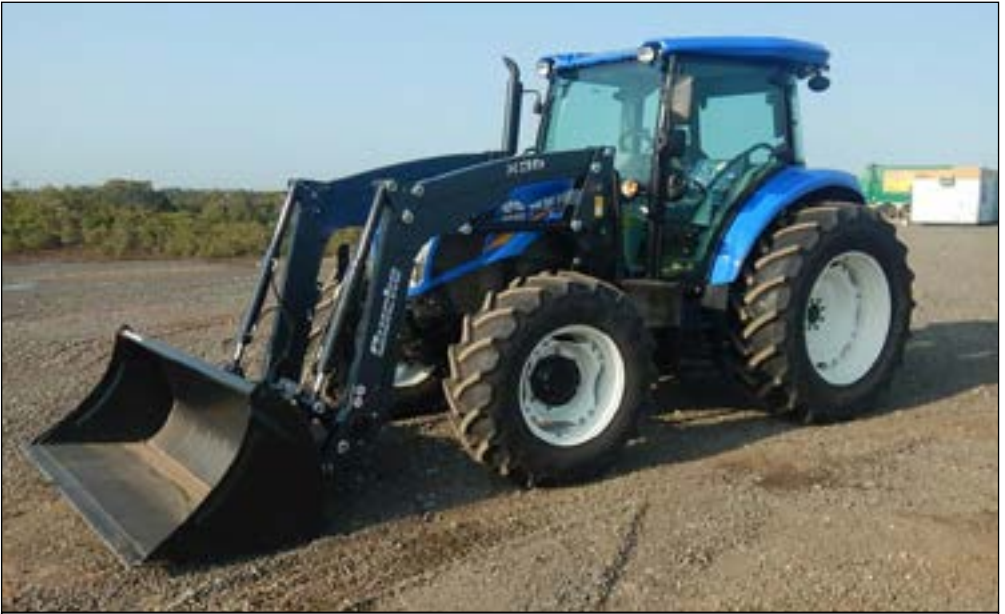
Unused New Holland TD5.95