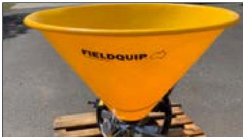
S2-500 Fertiliser Spreader - choice