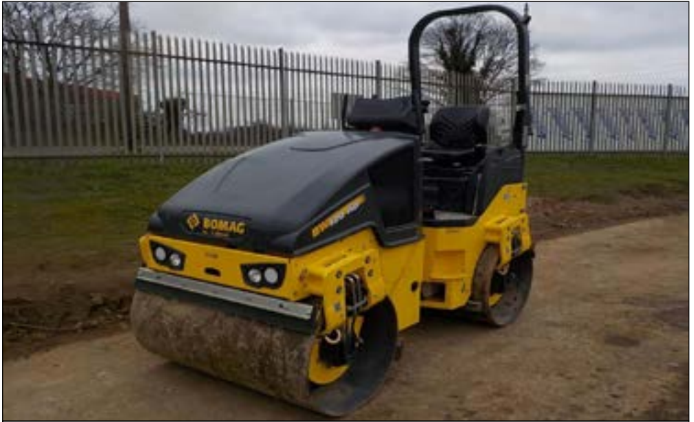
2018 Bomag BW120AD-5