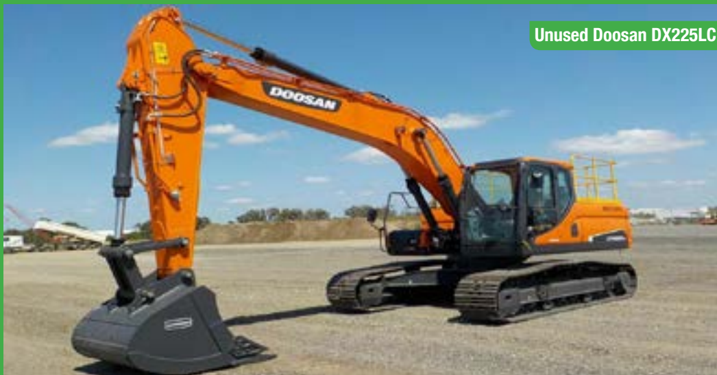
Unused Doosan DX225LC