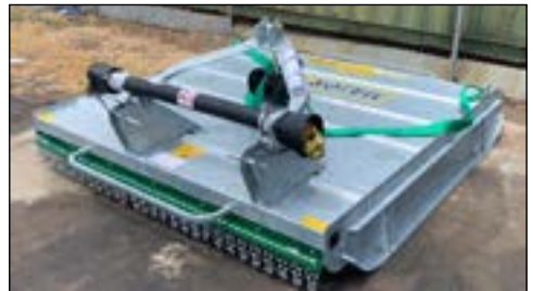
Unused Major Slasher 609SL - choice (Dealer Warranty)