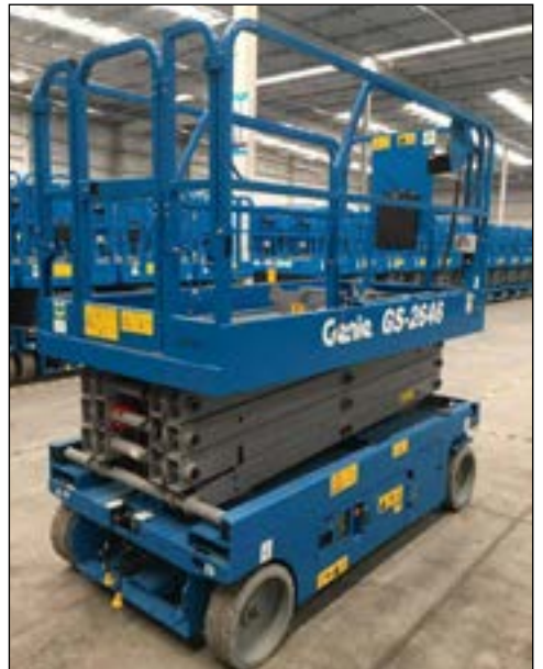
Unused Genie GS2646