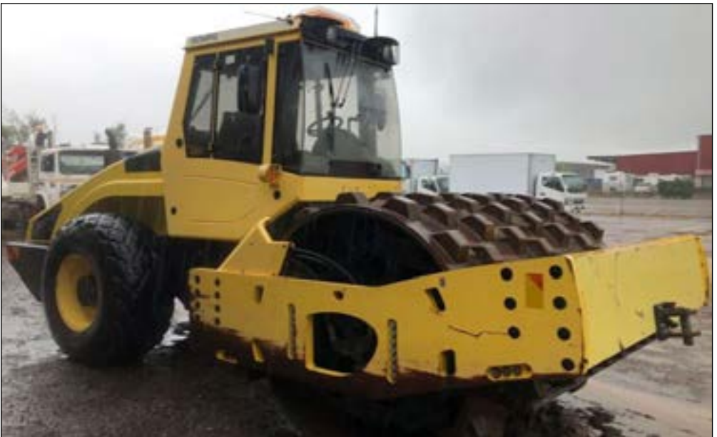
2008 Bomag BW216D-4