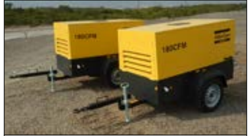
Unused Atlas Copco LUY050-7 - choice