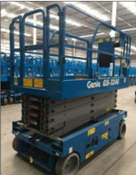
Unused Genie GS3246