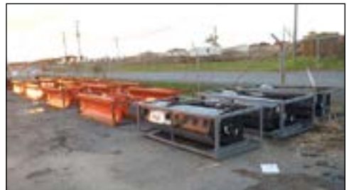
Large Selection of Skidsteer Attachments