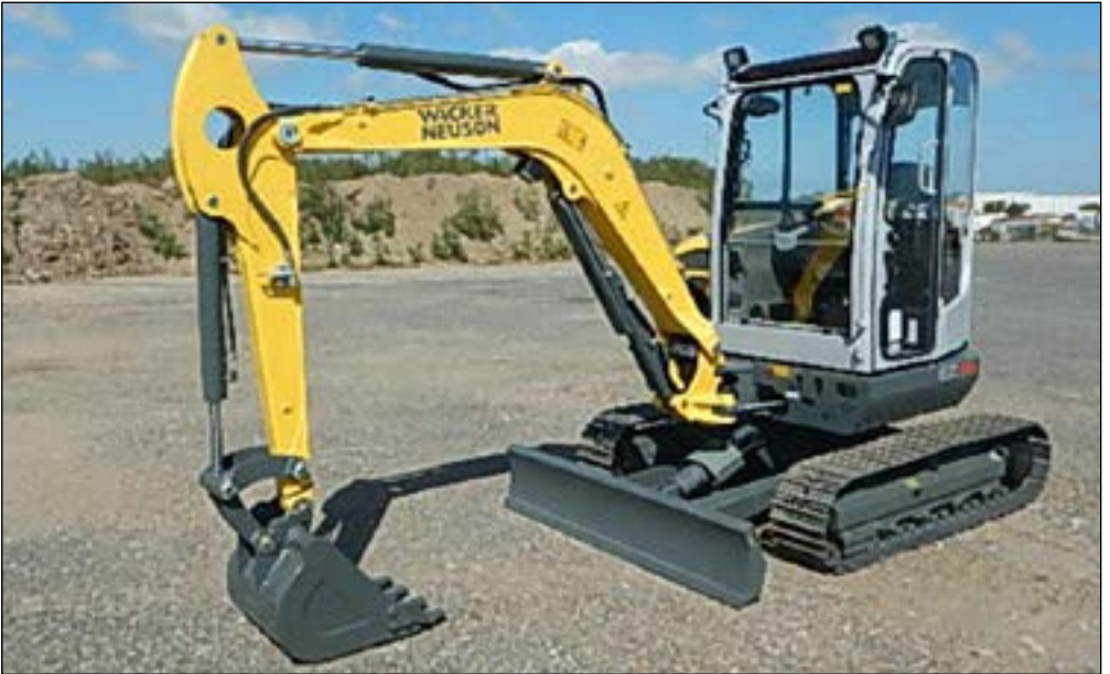
Unused Wacker Neuson EZ38