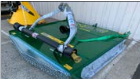
Unused Major Slasher 605SL - choice (Dealer Warranty)