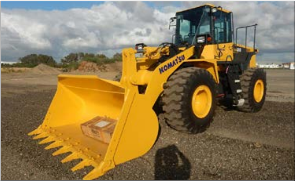
Unused Komatsu WA380Z-6