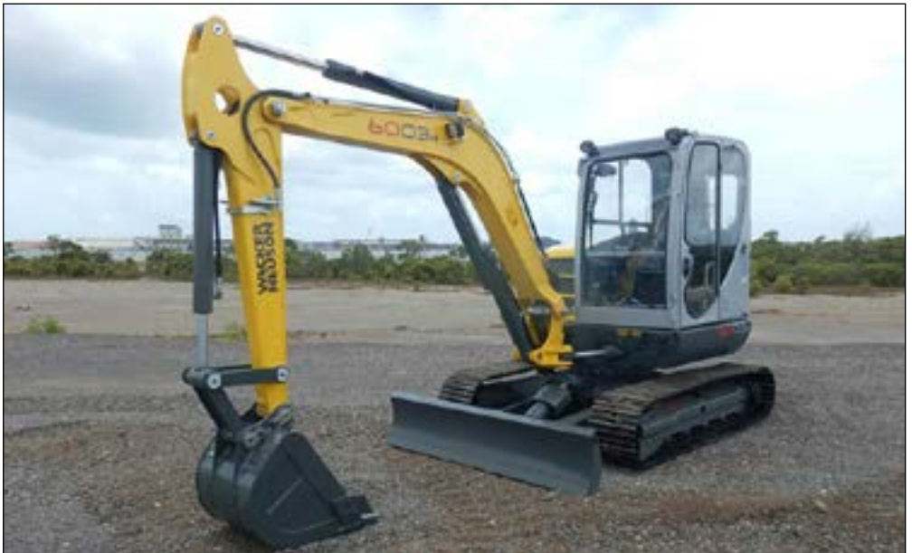
Unused Wacker Neuson 6003