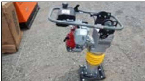
Unused Wacker Neuson MS64A - choice