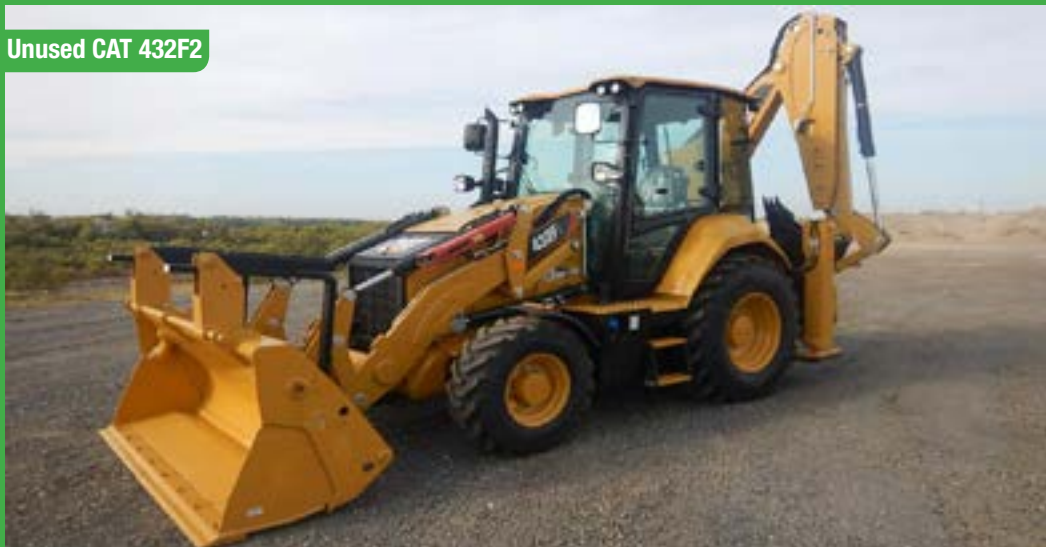
Unused CAT 432F2