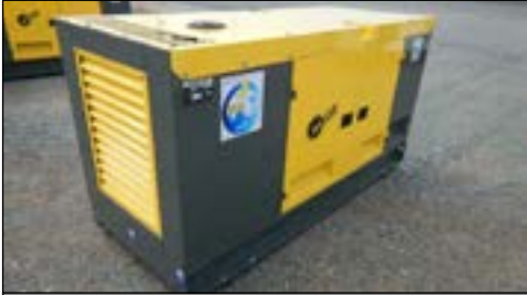
Unused Ashita AG3-60SBG 50Kva

Large Selection of Garage Equipment, Tractor Attachments, Miscellaneous items and much more...Visit our website: www.euroauctions.com for more information.