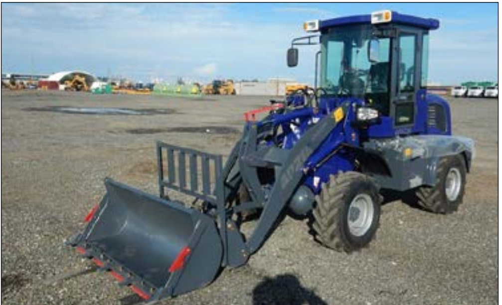
Unused Apache AP218