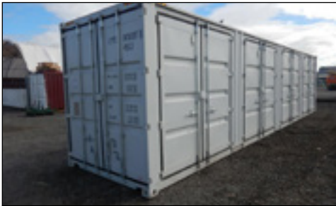
Selection of Unused Containers