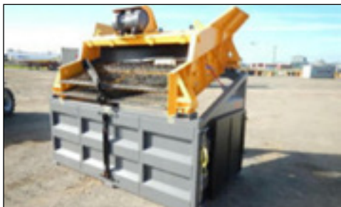
Unused Barford US70