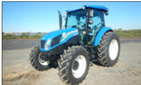
Unused New Holland TD5.95