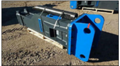
Unused Hammer HM1900 Sold to buyer from QLD