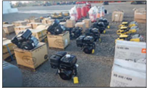
Large Selection of Unused Engines