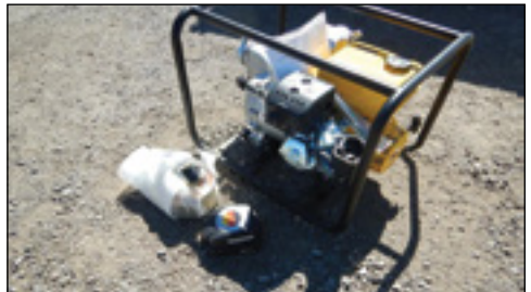
Unused MDP3 Water Pump Sold to buyer from Northern Territories