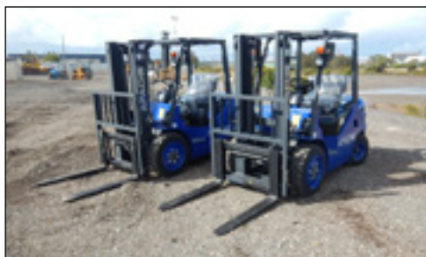
Unused Apache HH30Z