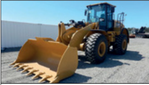
Unused Cat 950GC Sold to buyer from Victoria