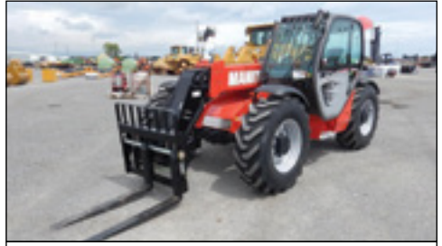
Unused Manitou MT732 Sold to buyer from NSW