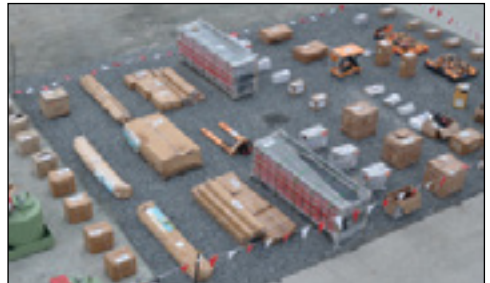
Large selection of Unused Garage Equipment