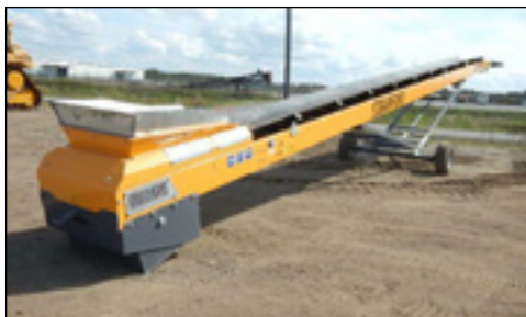
Unused Barford W5032 - choice