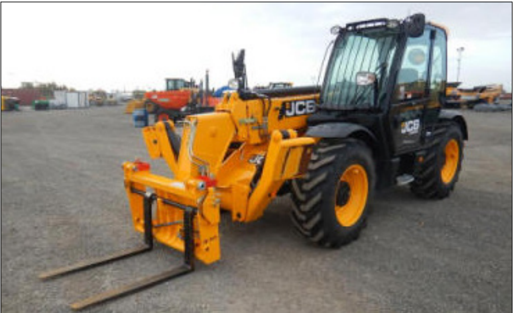
Unused JCB 533-105