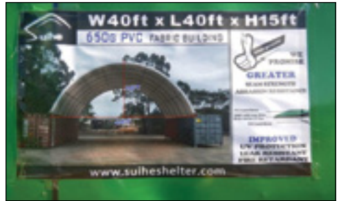
Selection of Container Shelters