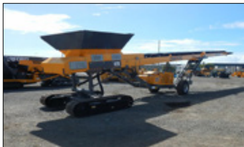
Unused Barford R6536TR