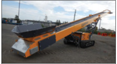
Unused Barford TR6536 Sold to buyer from NSW