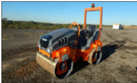
Unused Hamm HD12VV