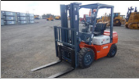
Unused Apache CPCD30 Sold to buyer from New Zealand