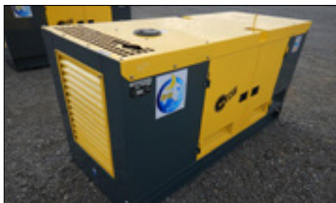
Unused Ashita AG3-50SBG 40kVA