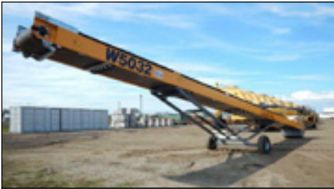
Unused Barford W5032 Sold to buyer from Victoria