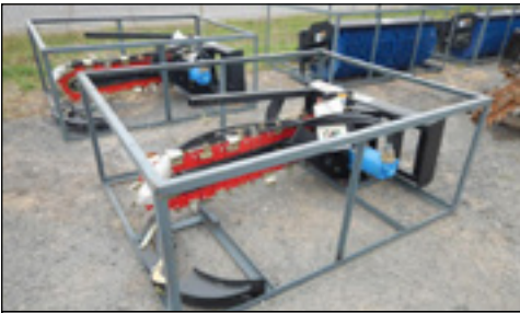
Selection of Unused Skidsteer Attachments