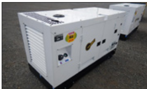
Unused Ashita AG-40 30kVA