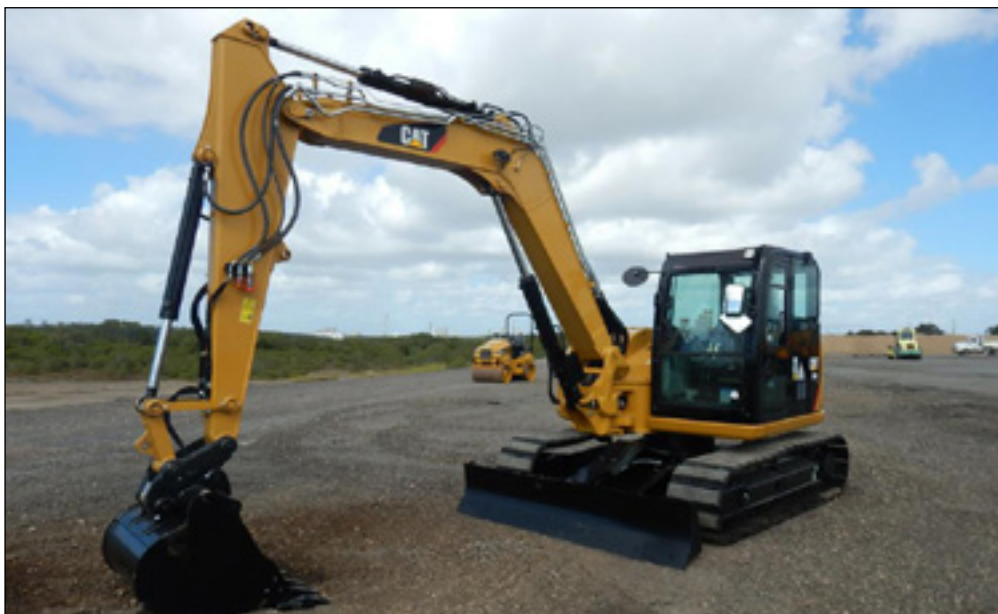
Unused CAT 308E2CR