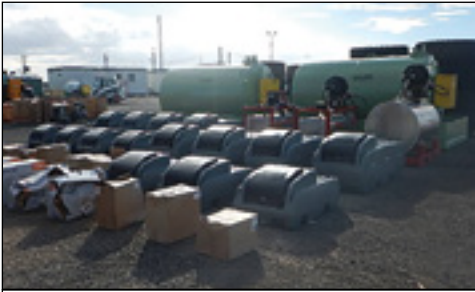
Large Selection of Unused Fuel Bowzers