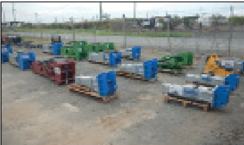
Large Selection of Unused Hydraulic Breakers to Suit 1.2-30 Ton Excavators