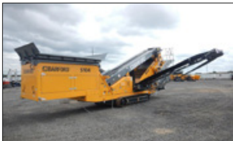
Unused Barford S104