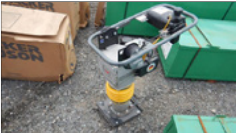
Unused Wacker Neuson MS62 Sold to buyer from New Zealand