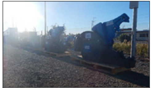
Large selection of Unused Excavator Attachments