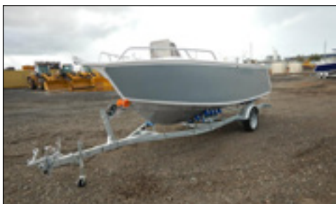
Unused Scariff 5000SC Boat & Trailer