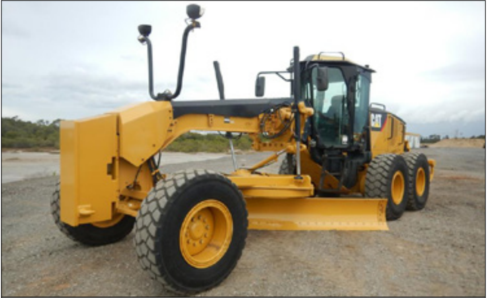
2013 CAT 140M (5,123 Hours)