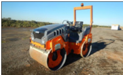
Unused Hamm HD13VV