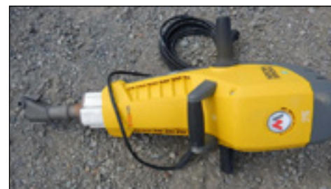
12-14 Wacker Neuson EH100/230 Electric Breaker - choice