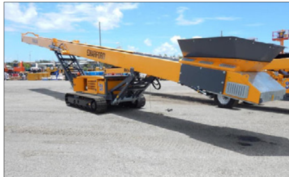
Unused Barford TR6536 Tracked Stockpile Conveyor