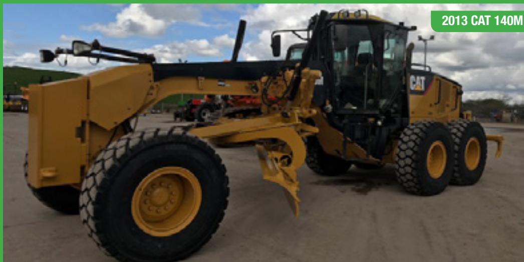
2013 CAT 140M