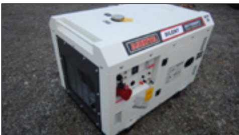
Unused Ashita DG1100SE3 10KvA Silent Diesel Generator, 3 phase - choice