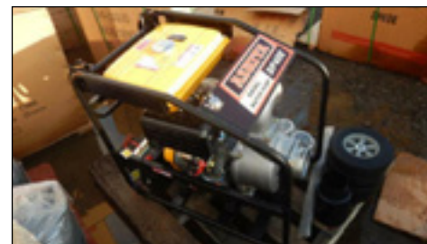
Unused Ashita DP40E 4" Self-Priming Water Pumps - choice