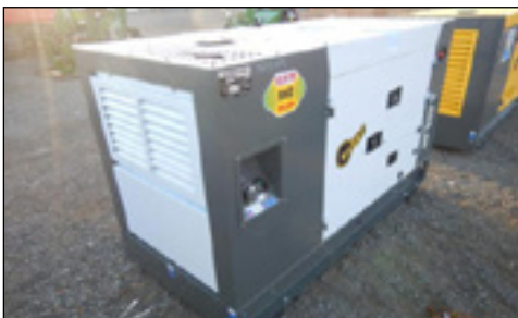
Unused Schmelzer SG-25 25KvA