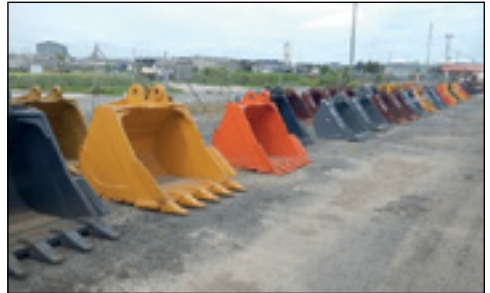
Large Selection of Unused Buckets