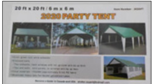
Unused 6m x 6m Marquee Event Tent C/W Side Walls, Windows & Zip Doors - choice