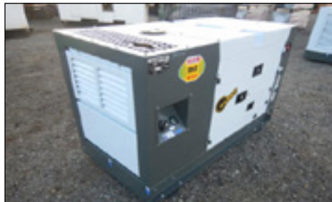
Unused Schmelzer SG-15 15KvA