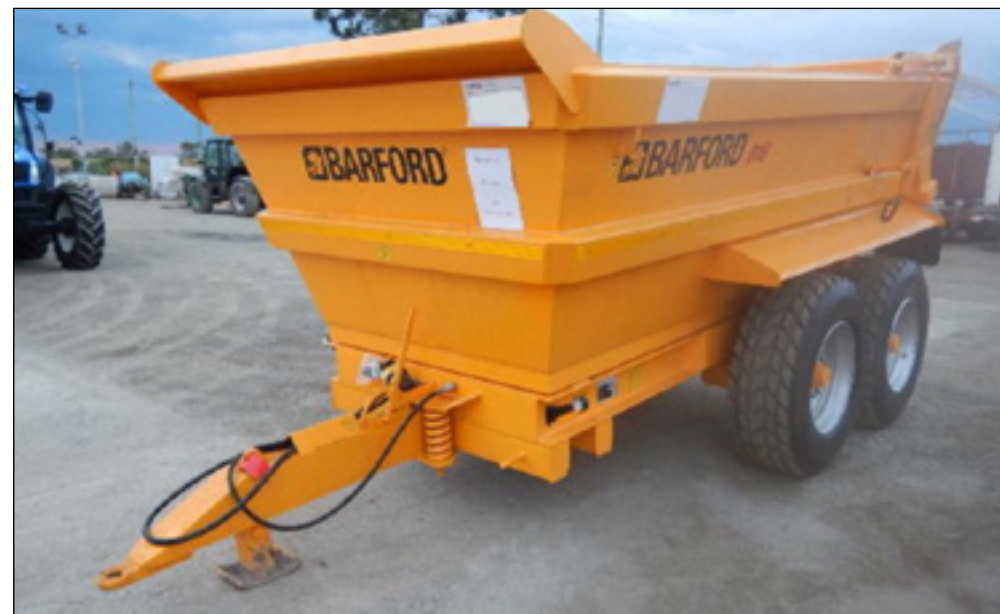
Unused Barford D16 16 Ton Twin Axle Dump Trailer