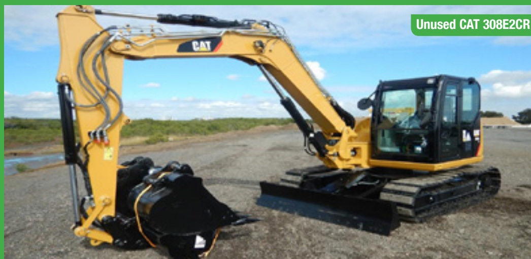
Unused CAT 308E2CR