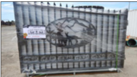
3.0m Wrought Iron Gates