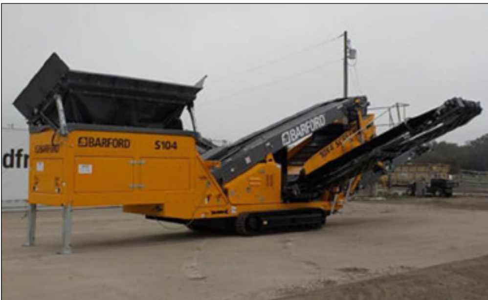
Unused Barford S104 Inclined 3 Way Split Screen