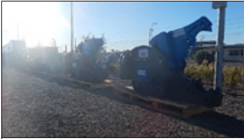
Large selection of Unused Excavator Attachments