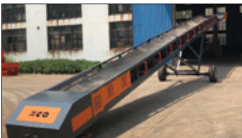
Unused XCG 3660 Wheeled Radial Stockpile Conveyor 60ft x 36" - choice