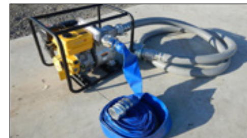
Unused Wacker Neuson MDP3 3" Water Pumps - choice