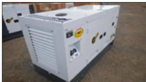
Unused Ashita AG-40 Skid Mounted 30KvA