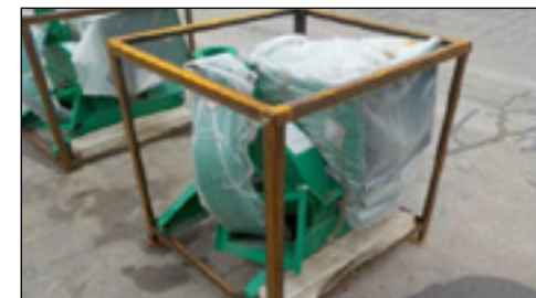
Unused 3 PTO Heavy Duty Wood Chipper to Suit 40-70Hp - choice