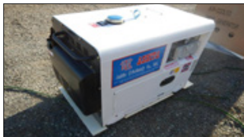
Unused Ashita AG7500D 3 Phase 6.25KvA Air Cooled Diesel Generator - choice