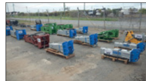
Large Selection of Unused Hydraulic Breakers to Suit 1.2-42 Ton Excavators