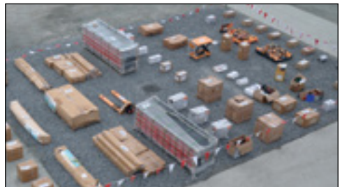
Large selection of Unused Garage Equipment