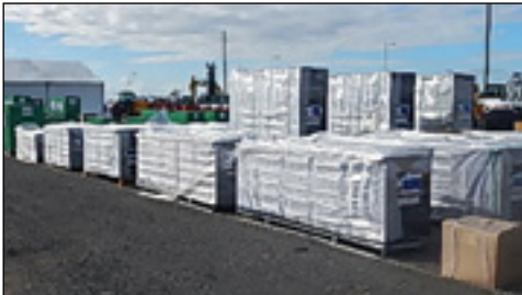
Unused Work Benches/Tool Cabinets - choice