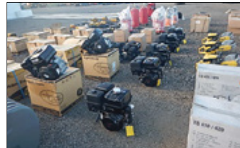
Large Selection of Unused Engines