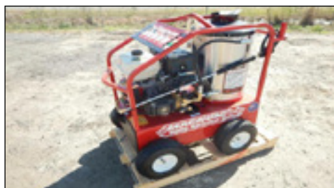
Easy Kleen Magnum GOLD Pressure Washer - choice