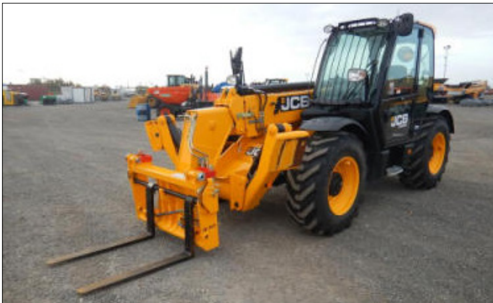
Unused JCB 533-105