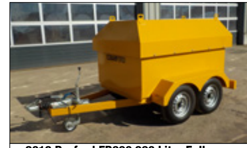
2018 Barford FB990 990 Litre Fully Bunded Fuel Bowser