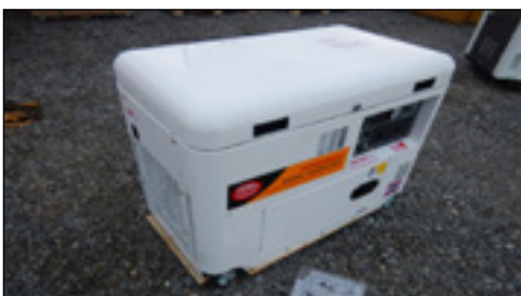
Unused Ashita AG7500D Single Phase 6.25KvA Air Cooled Diesel - choice