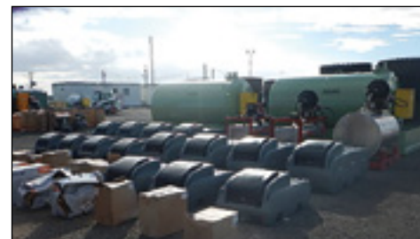
Large Selection of Unused Fuel Bowzers