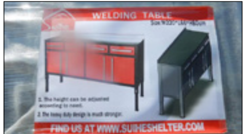
Unused 2.2m x 0.66m x 0.8m Welding Table - choice