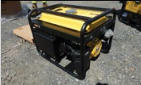
Unused Wacker Neuson MG3SD - choice