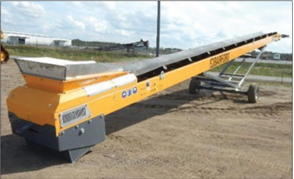
Unused Barford W5032