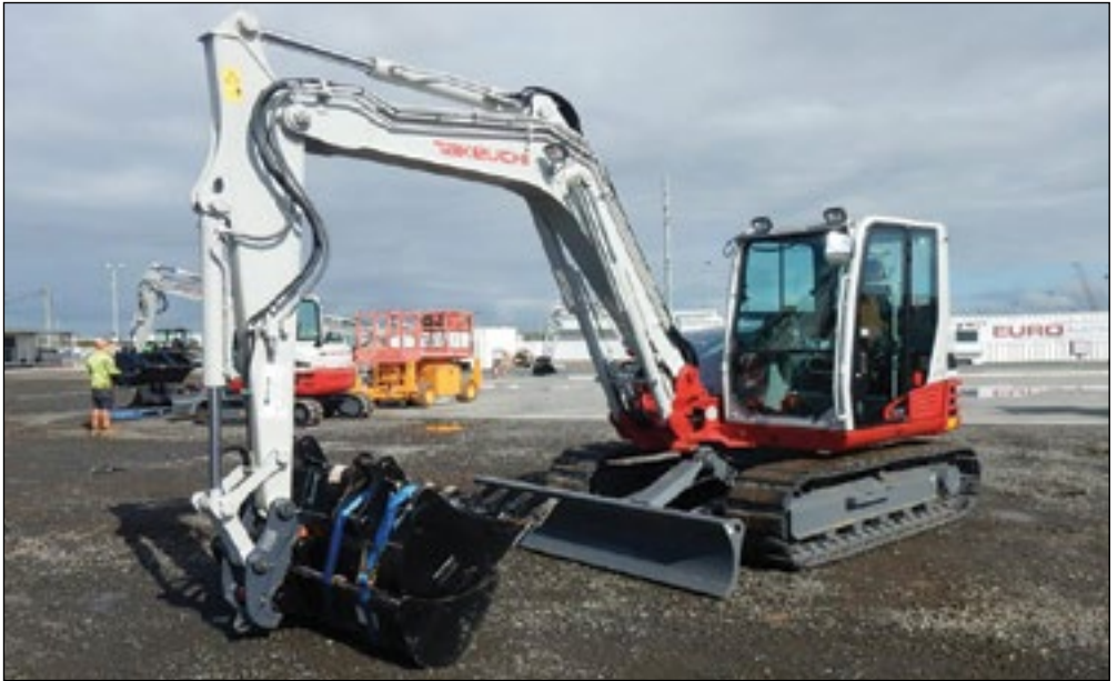
Unused Takeuchi TB290