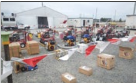
Selection of Unused Garage Equipment