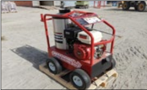
Unused Easy Kleen MAGNUM GOLD - choice