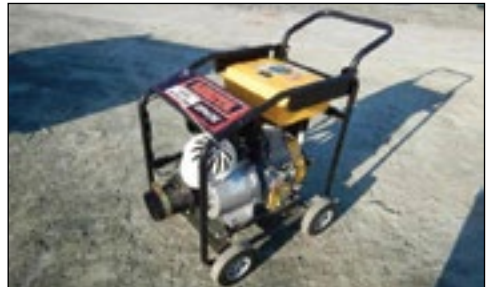
Unused Ashita DP60E Water Pump - choice