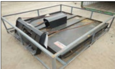
Unused 1800mm Rotary Brush Cutter