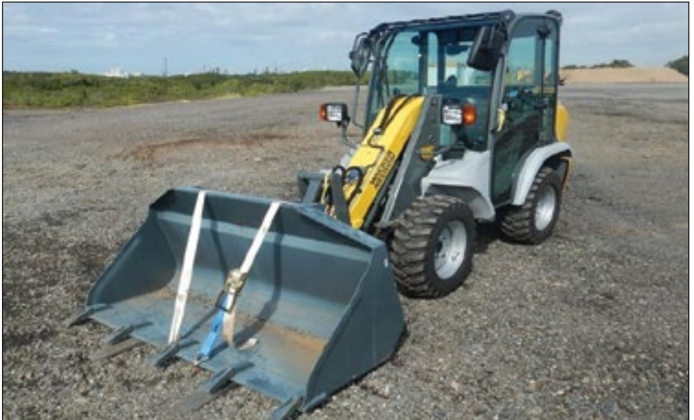
Unused Wacker Neuson 5035