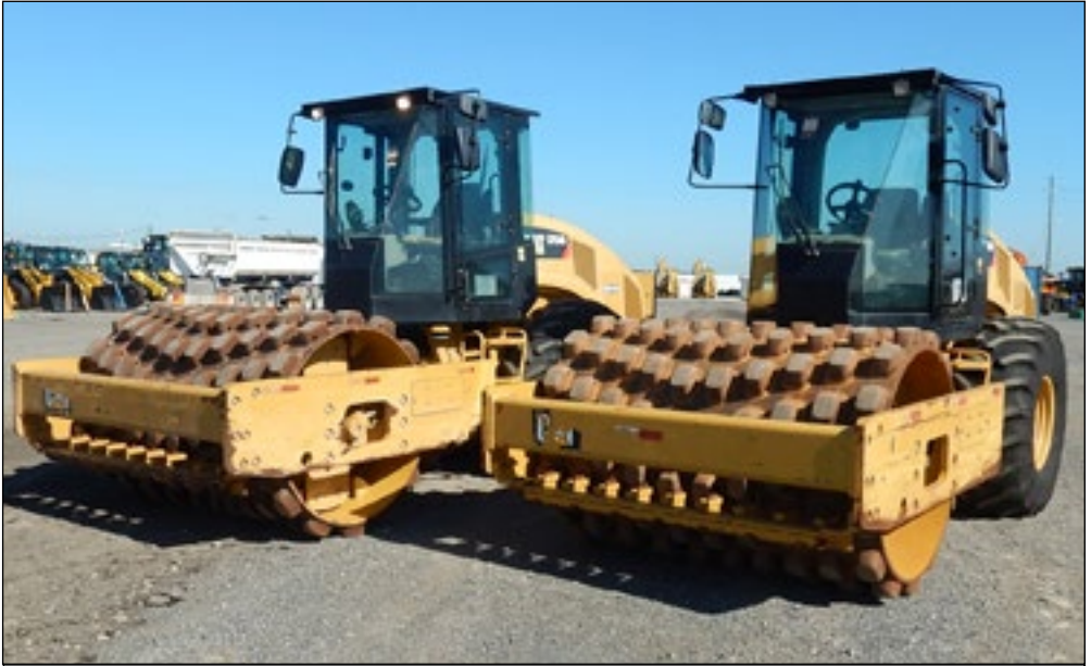
13-14 CAT CP54B - choice