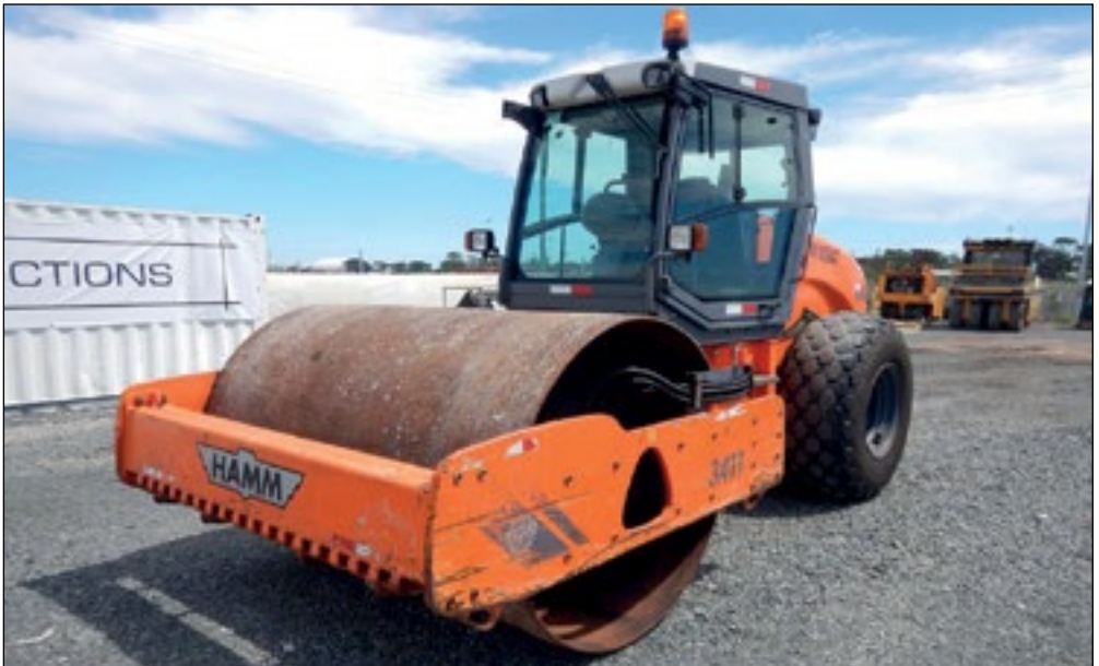
2015 Hamm 3411