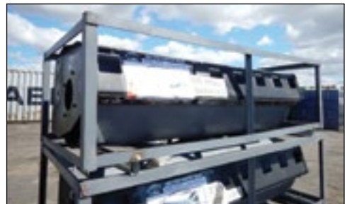
Unused 1825 mm Hyd Vibrating Roller