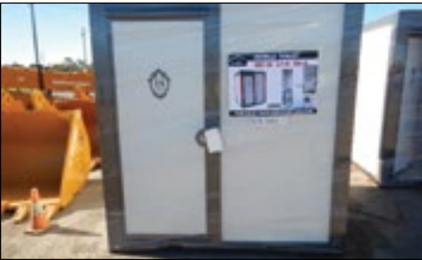
Unused Portable Toilet c/w Shower Unit