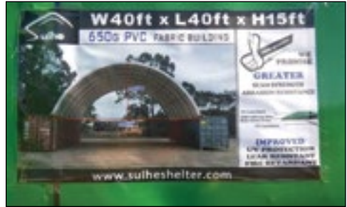
Unused Containers and Storage Shelters - choice