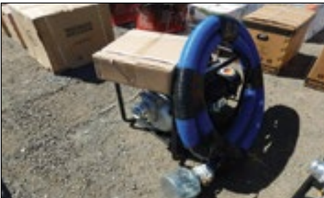
Unused Wacker Neuson MDP3 Water Pump - choice