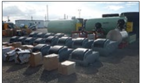
Selection of Unused Fuel Bowsers