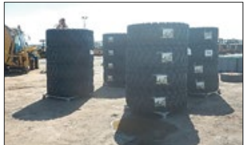
Unused 23.5-25 Tyres