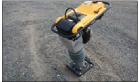
Unused Wacker Neuson BS60-21 - choice