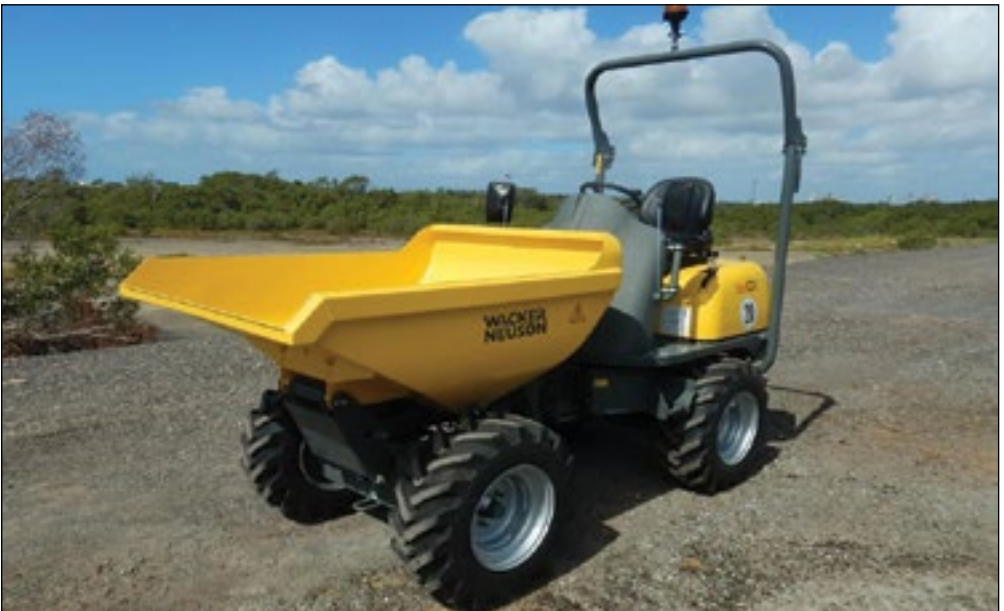
2017 Wacker Neuson 1601H