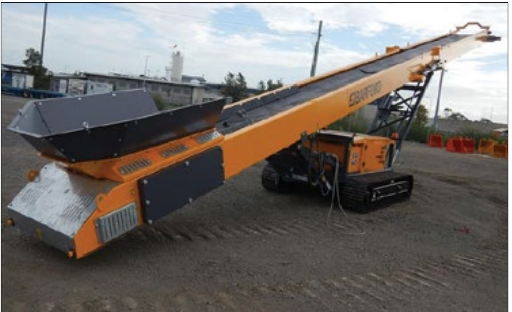
Unused Barford TR6536