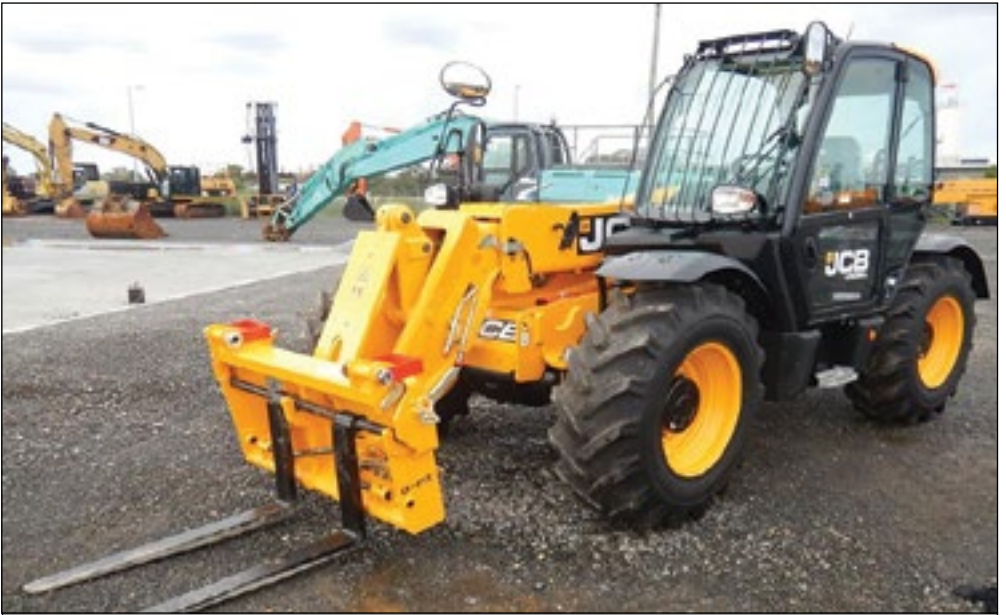
Unused JCB 531-70