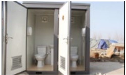
Unused Skid Mounted Portable Double Toilet