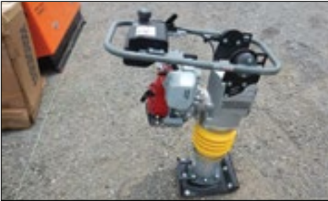
Unused Wacker Neuson MS64A