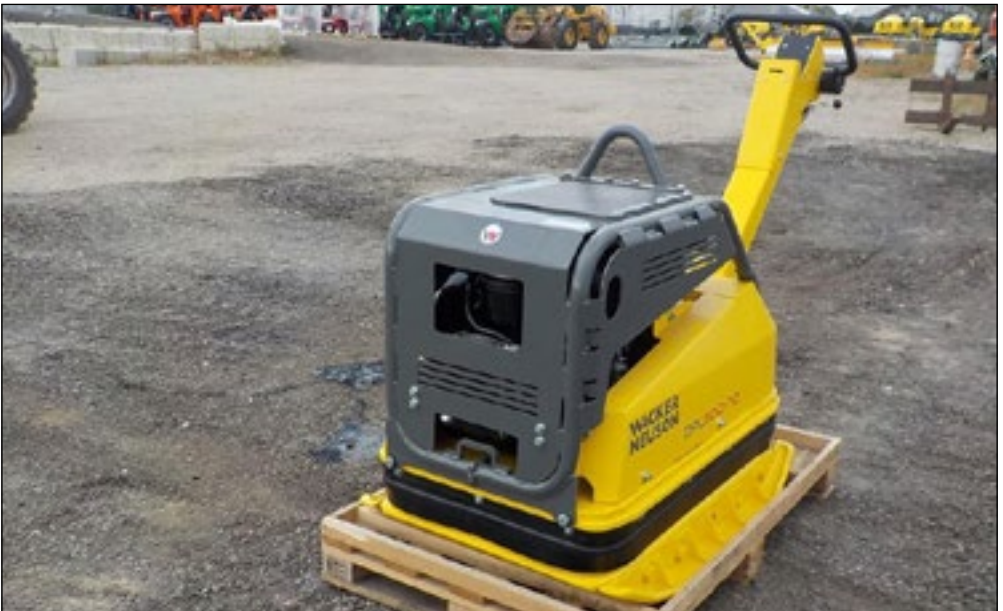
Unused Wacker Neuson DPU100-70 LES