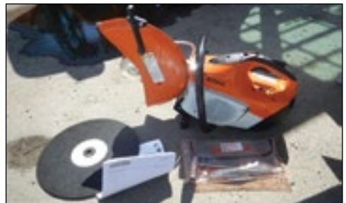
Unused Stihl TS410 12" Petrol Quick Cut Saw - choice