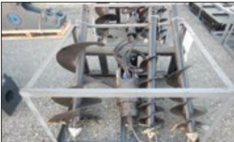
Unused Auger to suit Skidsteer Loader