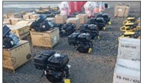
Large Selection of Unused Engines