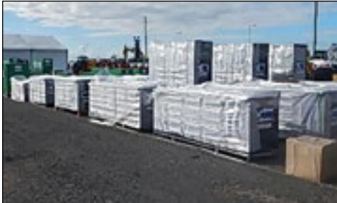
Unused Work benches/Tool Cabinets - choice