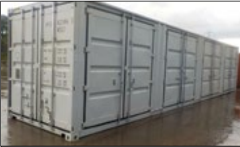
Unused 40" HC Container c/w 4 side doors