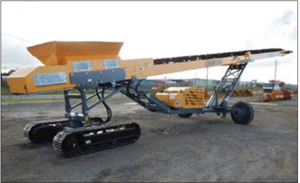
Unused Barford R6536TR