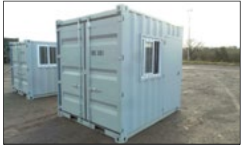
Unused 9" Container