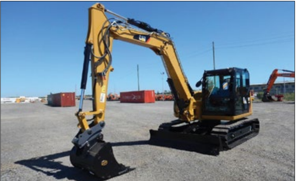
Unused CAT 308E2 CR